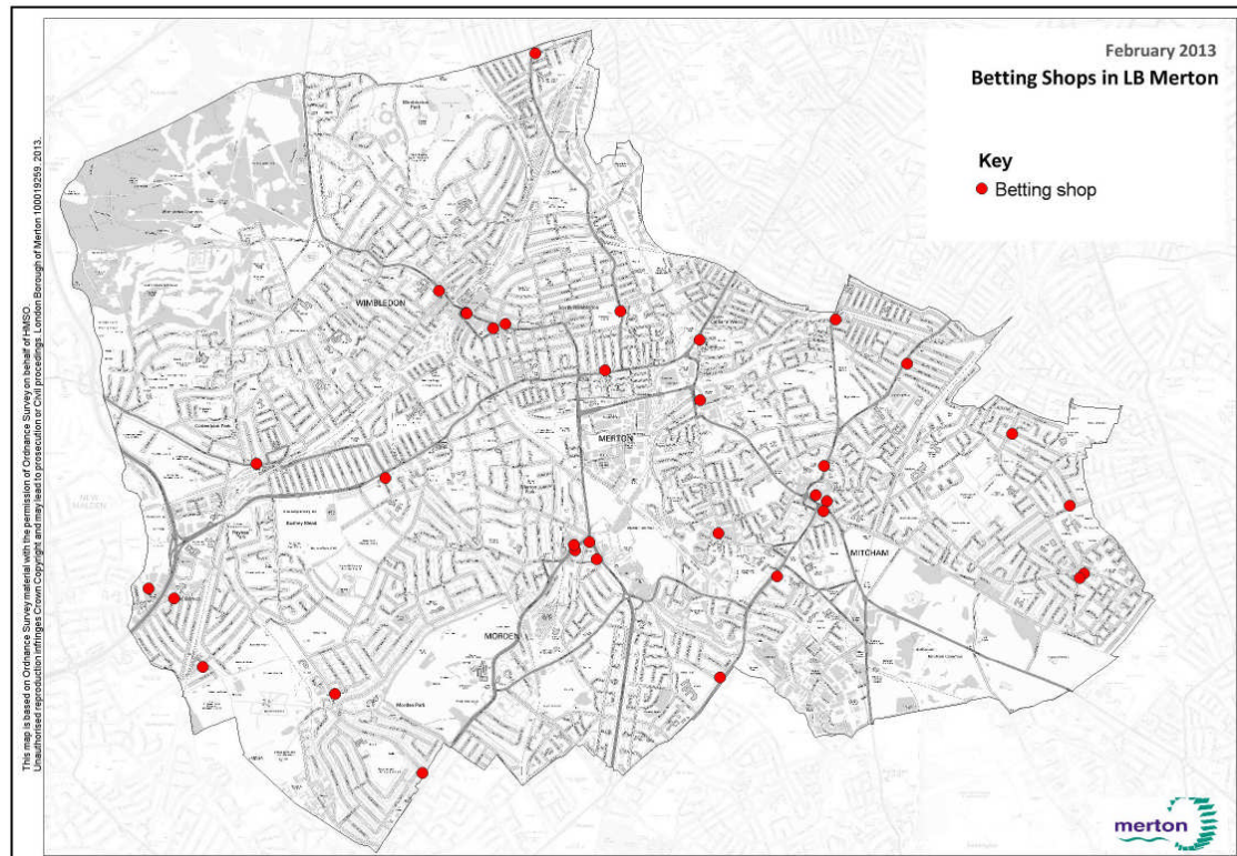
Figure 1: Map of Betting Shops in Merton as at 2013.