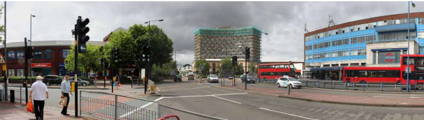
Figure 7: Intersection of London Road and Crown Lane

3.17 On the southeastern side of the London Road is a parade of shops with two storeys of offices and flats above. At the southern corner of the intersection of the London Road and Aberconway Road is a retail parade (which includes Iceland and Lidl), with a single storey of offices above and at the southern corner of the intersection of London Road and Crown Lane is the fourteen-storey Civic Centre building known as Crown House (see photograph above).