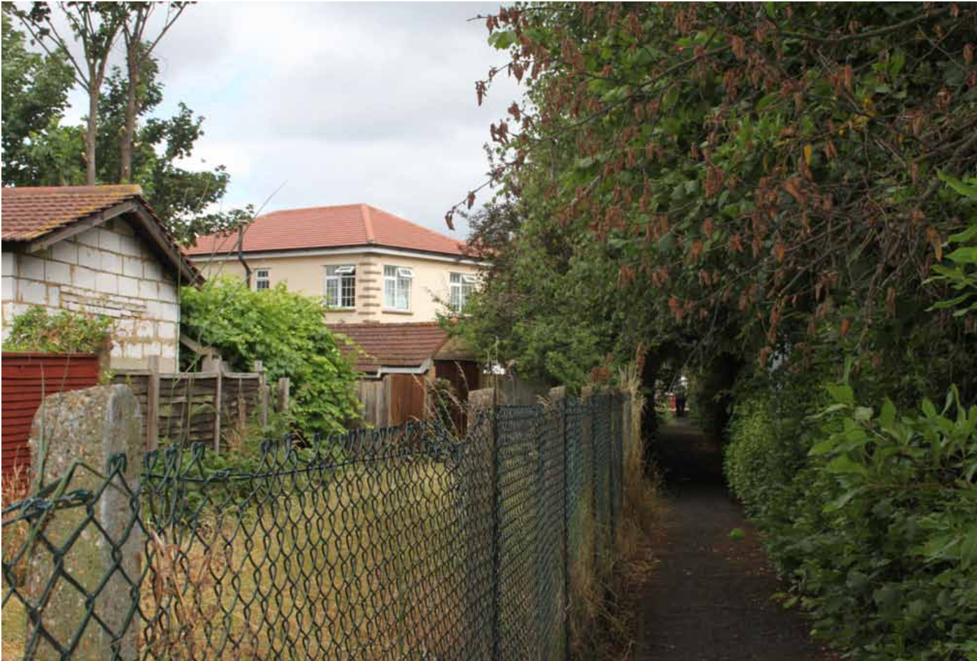
Figure 6: Block of flats on land to the rear of 125 Kenley Road