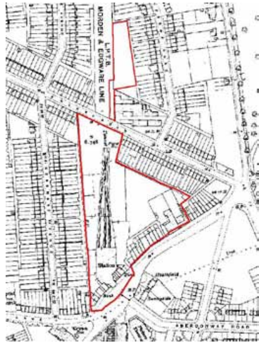
Figure 11: 1934