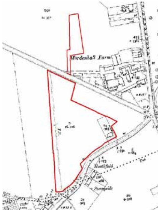
Figure 10: 1916

1992 - The replacement of the former Odeon Cinema building with the current two-storey building with retail at ground level and offices above (where Iceland and LIDL currently are located).