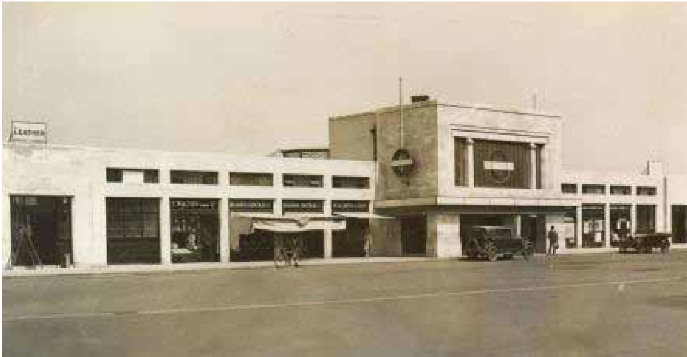
Figure 8: Morden Station 1926