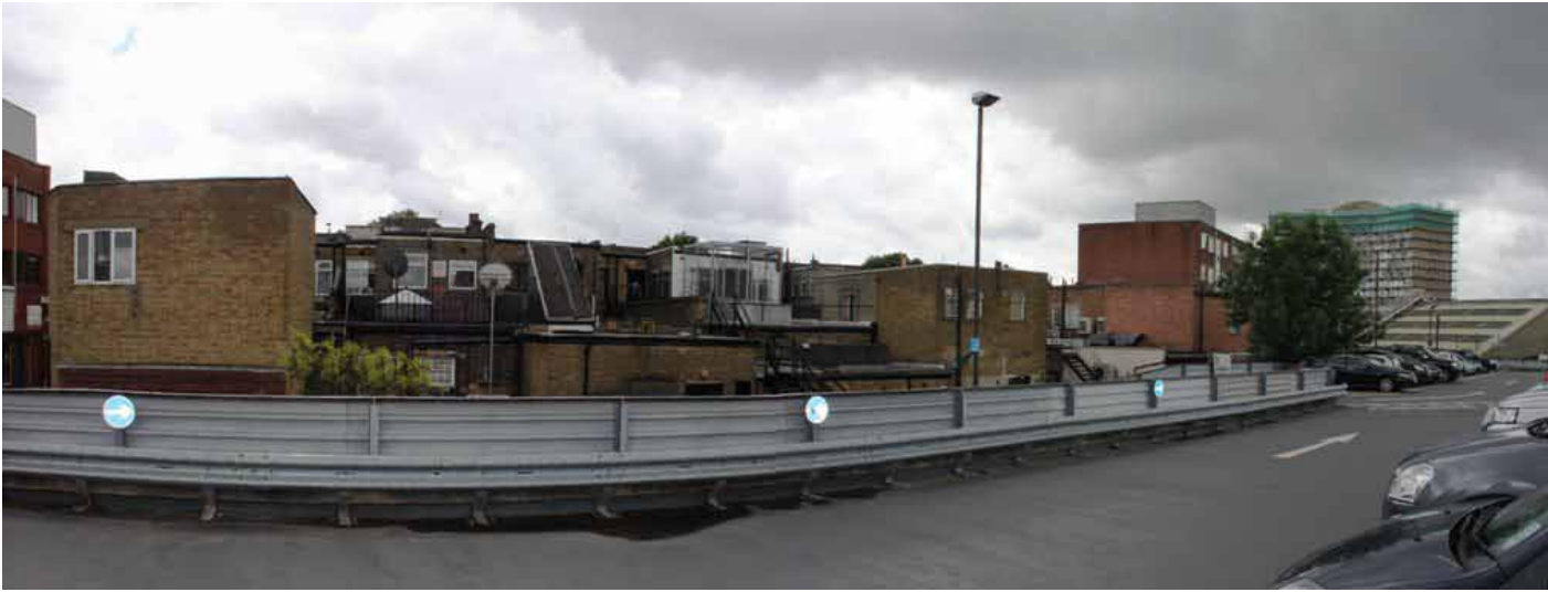
Figure 2: Rear of 46-64 London Road viewed from Peel House Car Park