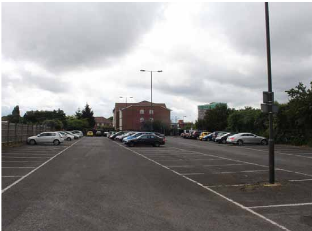
Figure 4: Kenley Road Car Park

3.16 At the northwestern corner of the site is a small block of flats that was erected on land to the rear of 125 Kenley Road, which has windows to habitable rooms approximately 6m from the site boundary (see photographs). All the other properties adjacent to the northern boundary of the site are two-storey houses and the rear of the houses at 127-173 Kenley Road is approximately 30m from the site boundary.