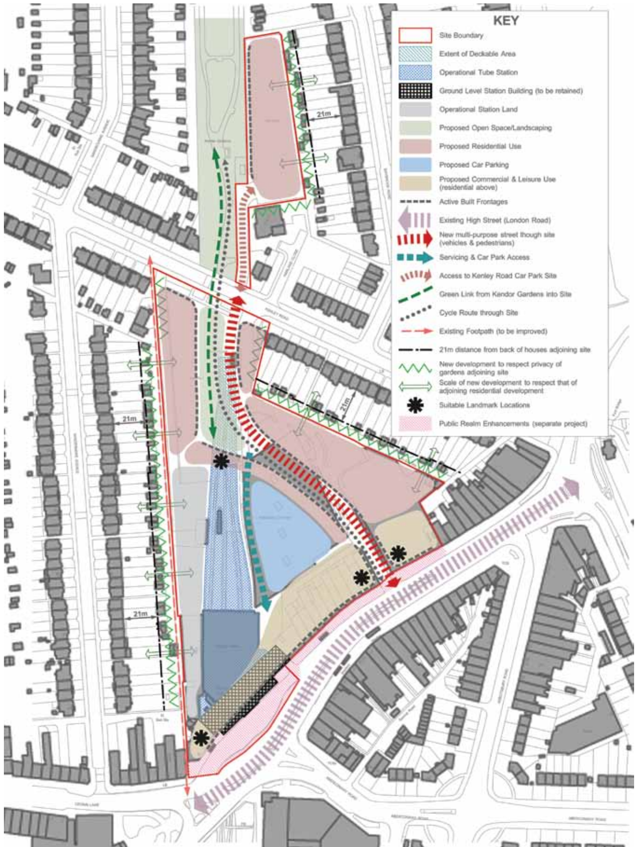
Figure 15: Key diagram

Crown Copyright. All rights reserved. London Borough of Merton 100019259. 2011.