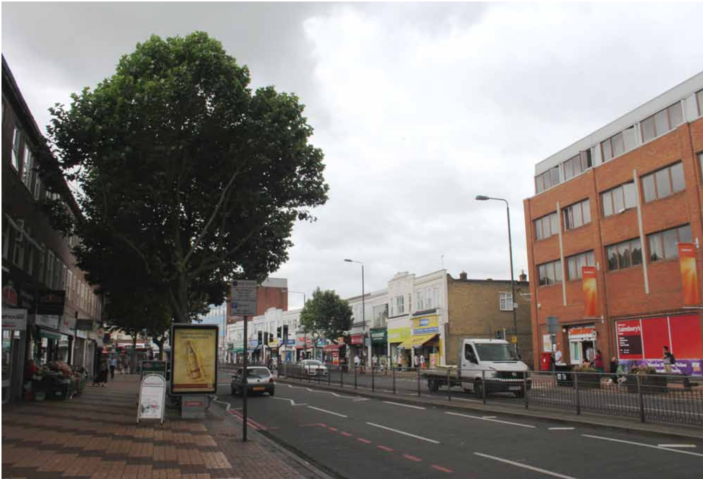
Figure 3: View of London Road