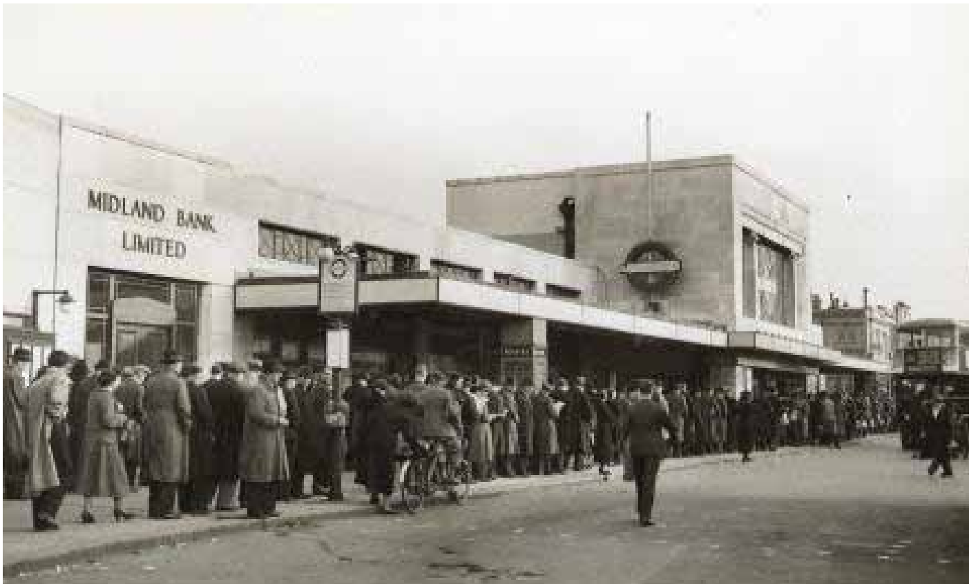
Figure 9: Morden Station, 1934, with addition of bus canopy.