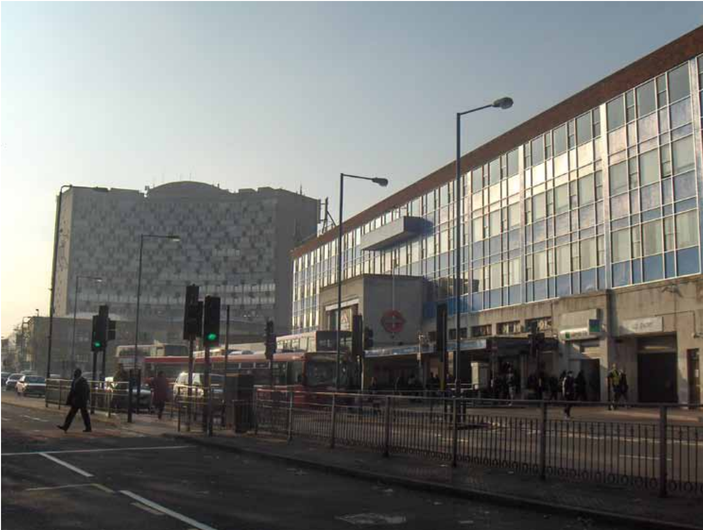
Figure 14: Public realm in front of station requires improvement