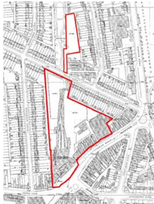
Figure 13: 1976