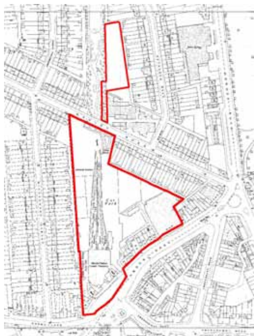
Figure 12: 1953