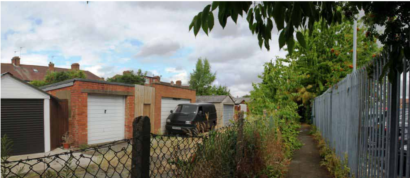
Figure 5: Public footpath garages at the rear of houses facing onto Windermere Avenue