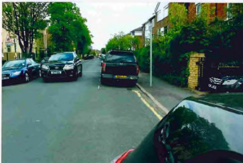
CROSSOVER AT 24 ←

CAR E055 VPA STILL UNABLE TO PROCEED - WITH PROPOSED PAVEMENT EXTENSION THERE WILL BE CONGESTION MOST OF THE DAY. THIS IS ONE OF THE WIDER ROADS IN MERTON.