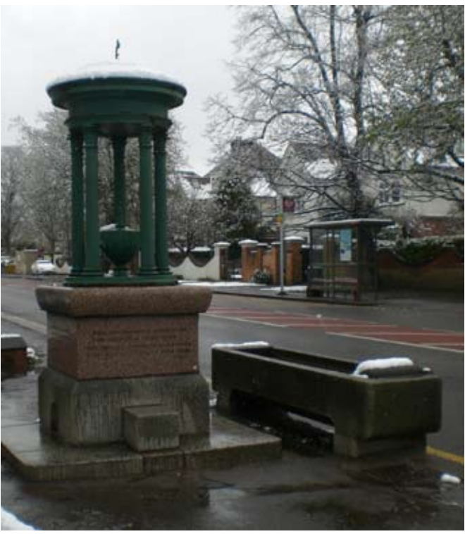
Drinking fountain and horse trough, Parkside Avenue, Wimbledon