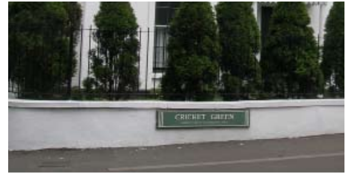
Conservation area street name sign, Cricket Green, Mitcham