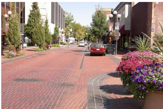
Example of 'Home zone' style scheme

The layout and design of home zones varies depending on the location and the context and details should be developed on a site specific basis. It is important to involve the local community in the development of these zones, as their success is to a large extent based on their use by the community.