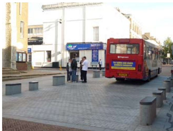
Shared surface paving in Ashford with combined seat/bollards