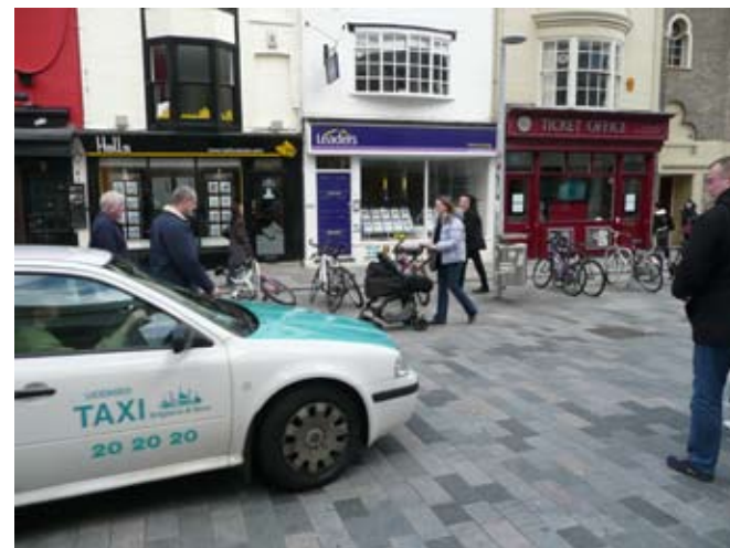
Shared surface paving in Brighton

The detailed layout and design of shared surface will vary for each situation and should be looked at on a case by case basis.