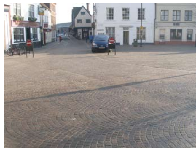
Shared surface paving in Newbury Market Square