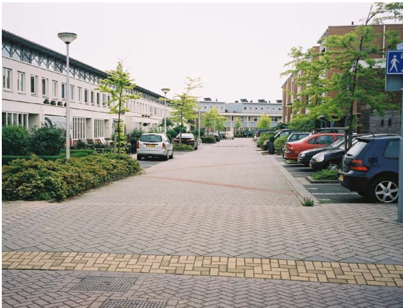
Example of 'Home zone' style scheme