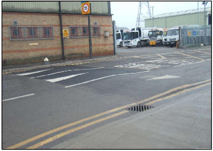
PHOTO OF SINUSOIDAL ROAD HUMP INSTALLED AT THE RECYCLING CENTER IN AMENITY WAY – MORDEN