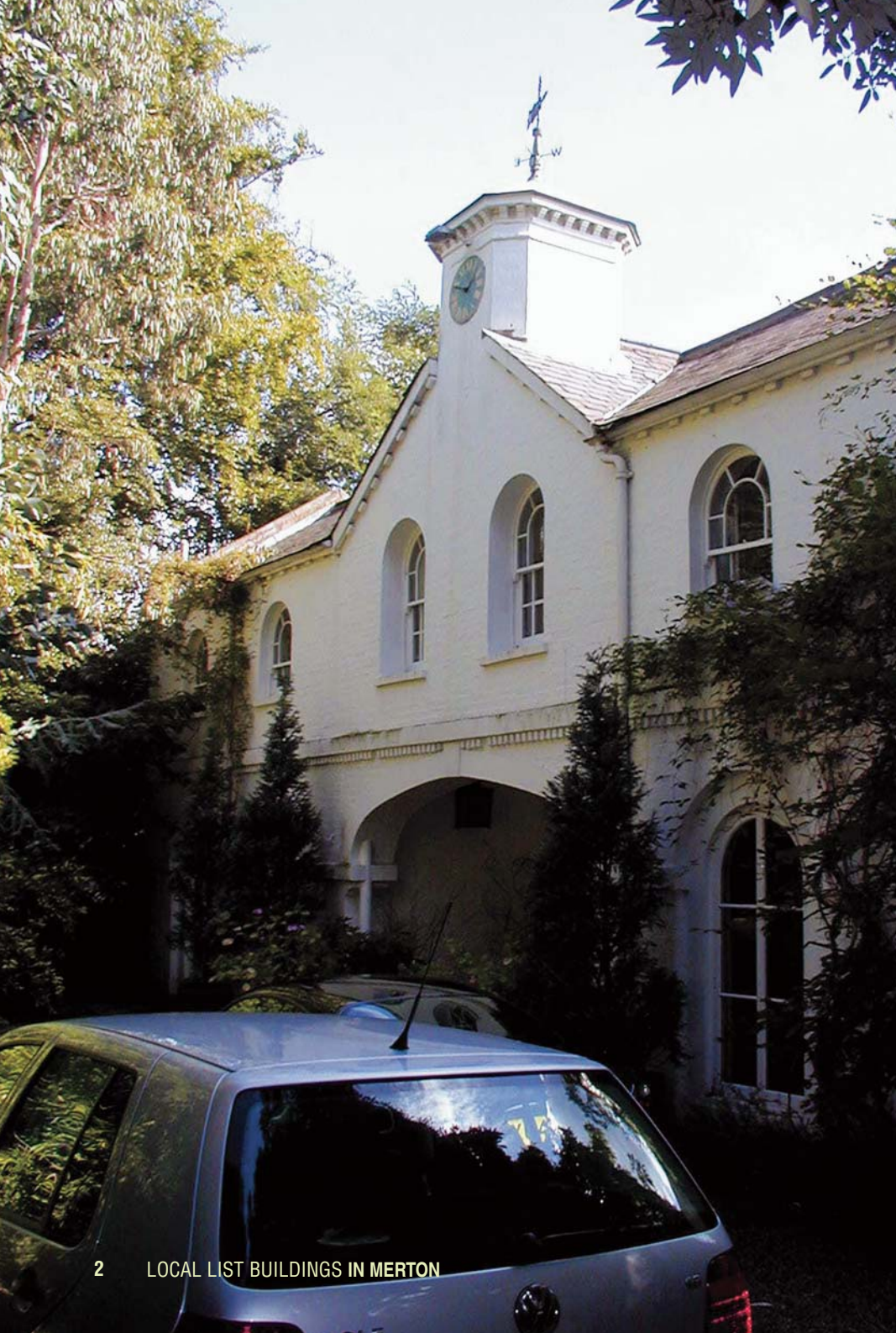
32 Coach House Lane, Wimbledon.