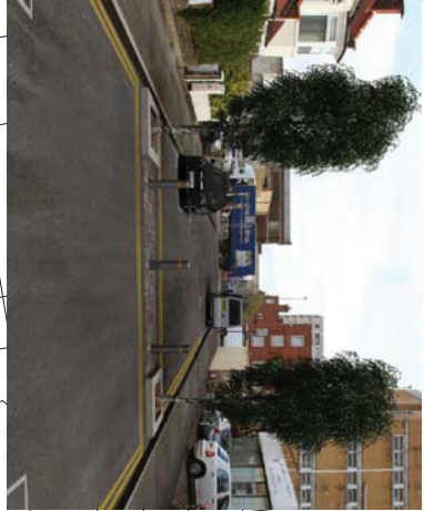
Gated barrier Concept Location: Milner Rd

Reproduced from/based upon the Ordnance Survey's 1:1250 maps with the permission of the Controller of H.M.S.O., Crown Copyright Reserved. Unauthorised reproduction infringes Crown copyright and may lead to prosecution or civil proceedings London Borough of Merton 100019259 2014