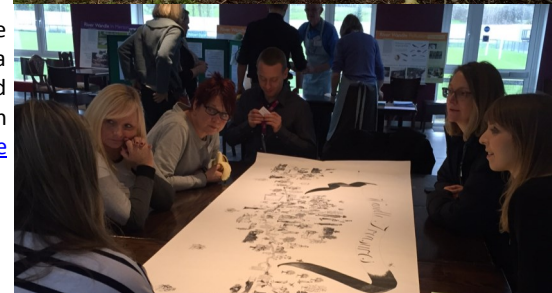
Social Landlord staff enjoying a Wandle Treasures Quiz at the workshop, something all residents can access