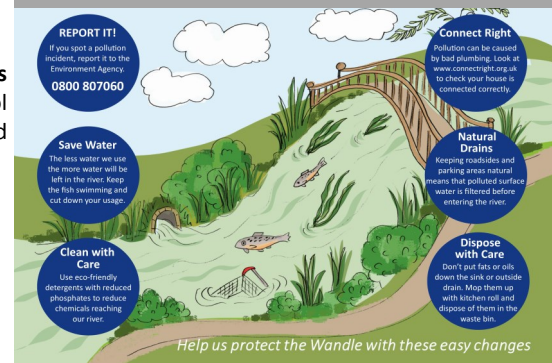
Pollution Prevention Leaflet