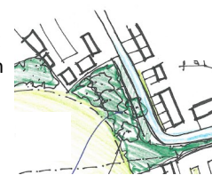
Volunteer site sketches

Catchment Plan: The River Rehab volunteer team are taking forward 2 designs for selection in February. Once the final restoration site is selected they will work towards delivering it in late 2016. More information can be found on the Wandle Trust blog .