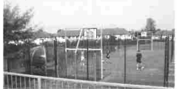
King Georges new ball court - 10/05/06