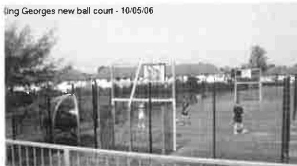
King Georges new ball court - 10/05/06

All homes will be required to have some private space: all flats with balconies and all houses will have gardens. In addition, flats must have access to communal gardens. The estate also needs parks, playspaces and open spaces to serve its residents and the surrounding area. As there is a limited amount of space available, a balance therefore needs to be struck between the provision of private outside space for residents and public open space for everyone.