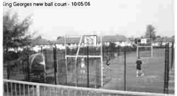
King Georges new ball court - 10/05/06

Multi-use games areas such as fenced, hard surfaced areas for 5 a-side football, netball, tennis or similar sports.