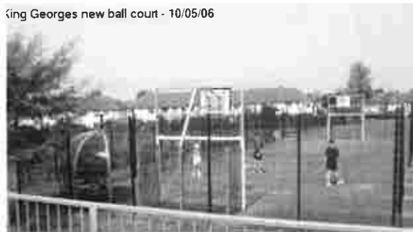
King Georges new ball court - 10/05/06

Communal gardens such as areas with planting and seating suitable for picnicking and where ball games might be prohibited.