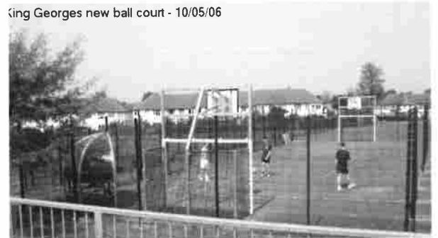
King Georges new ball court - 10/05/06

Communal gardens such as areas with planting and seating suitable for picnicking and where ball games might be prohibited.