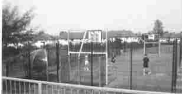
King Georges new ball court - 10/05/06

Communal gardens such as areas with planting and seating suitable for picnicking and where ball games might be prohibited.