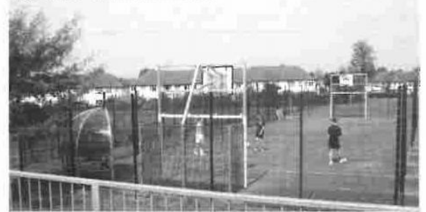
King Georges new ball court - 10/05/06