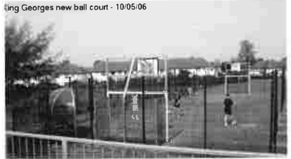
King Georges new ball court - 10/05/06