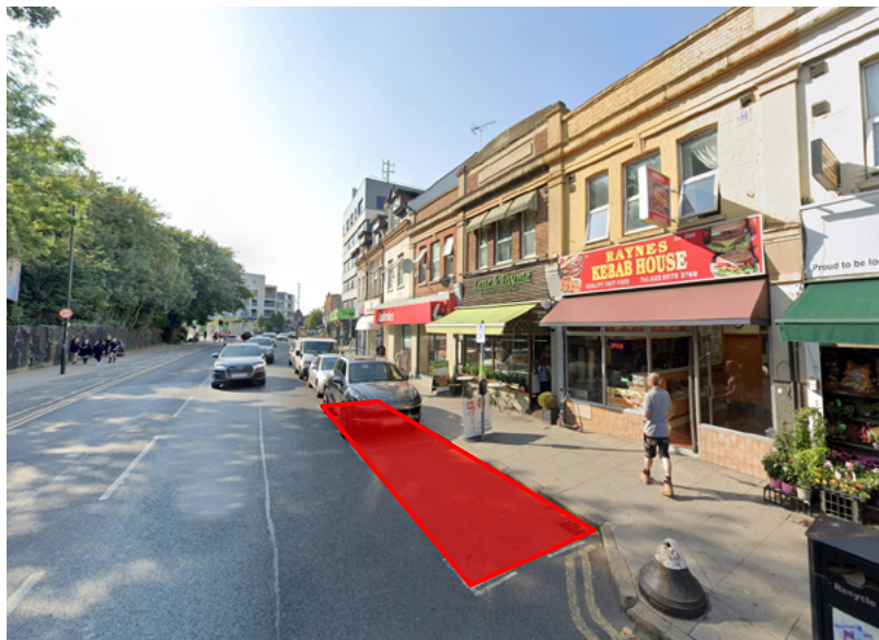
Location of parklet structure highlighted in red

The order will come into effect on Friday 9th July 2021 and remain in place for no more than 18 months. The consultation will be open for 6 months. Please use the online service to provide feedback on the Council's website below.