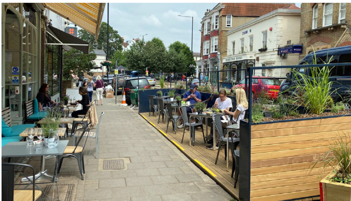
The first parklet of 8 delivered on the High Street, Wimbledon

The council are working with FM Conway and Meristem Design to design and deliver this exciting initiative across the borough.