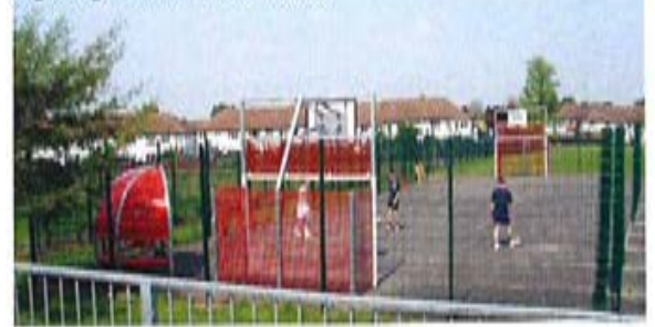
King Georges new ball court - 10/05/06