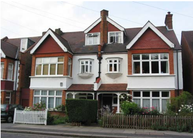
Nos. 84/86 & 88/90

The infill dwelling adjacent to number 76 is a gable ended two-storey building with accommodation in the roof space. Originally it was built with an integral garage, which has been converted into living space. The front amenity space has been paved over to provide off street parking with little planting. In keeping with the neighbouring properties it has a tiled roof and porch, brick at ground floor level and rendered above. Tall iron railings and double gates form the front boundary, which is out of keeping with the surroundings.