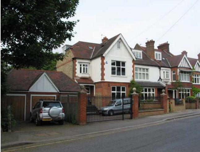
No.96 plus rebuilt garages

with tudor style applied timber strapwork. Numbers 80/82 are rendered between the lower and upper bays but the others have tile hanging. All are red brick at ground floor level and rendered above. Numbers 84/86 and 88/90 have red brick quoins on the outer corners. All dwellings have original timber framed open porches with red tiled roofs. Above each porch is a splayed oriel window with timber detail above the glazing. No. 90, alone retains the original oriel glazing bars. These semi detached buildings feature arched shaped windows in the side elevations constructed within the chimneybreasts which are visible from the street.