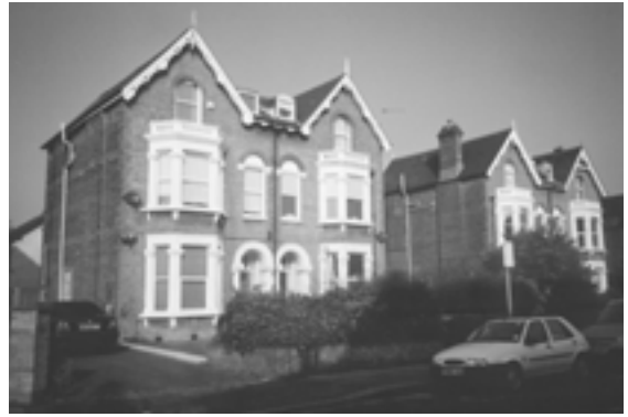
Above: left, Nos. 32 and 34, converted into 'The Westminster Queen Court'. Right and below: Nos. 36 to 40, converted and extended as 'Quadrangle Court'; the new development is not apparent until one is directly opposite. Right, the rear block dominating the courtyard.