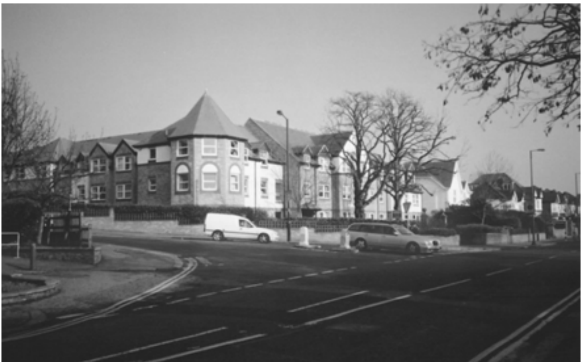
Above, the modern development at the junction of Queen's Road and Ashcombe. Below, views the south side of Prince's Road from the east and the west.