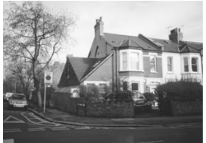
Above, Nos 45, 49, 51 and 53 Trinity Road, and the unconventional extension to Nos. 77/ 78. Below: Nos. 59 to 62, typical houses showing the two front doors within each porch.