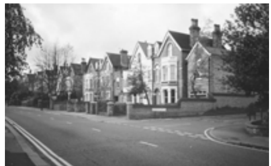
Above: typical two and three storey houses on the outside curve of Queen's Road. Left, Nos. 64 and 66. Right: above Nos 44 and 46, and below Nos.60 to 74 showing the side extensions.