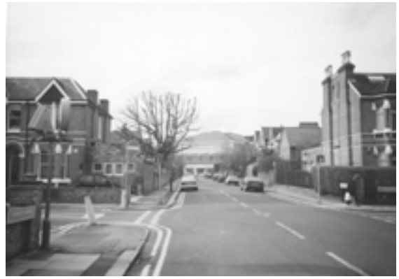
Above: Left, No. 10 King's Road, at the junction of South Park Road, and right at view west along Prince's Road showing the commercial development in Queen's Road, outside the CA.