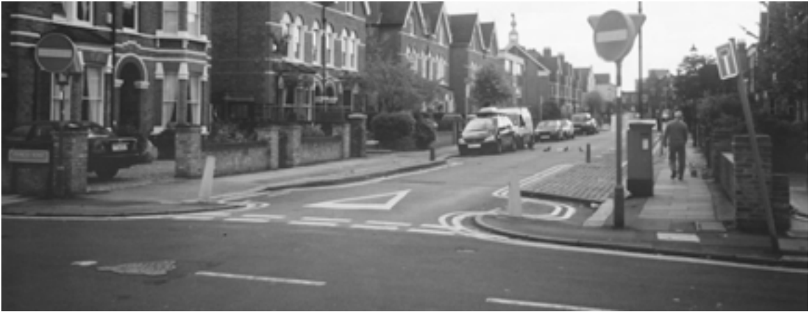
Above: the junction of King's Road and Princes Road showing typical areas of tarmac and yellow lines. Below: right, the eastern entrance gate into the Gardens showing its junction with the chain link fencing; and left the unsightly huts in the south-western corner of the Gardens.