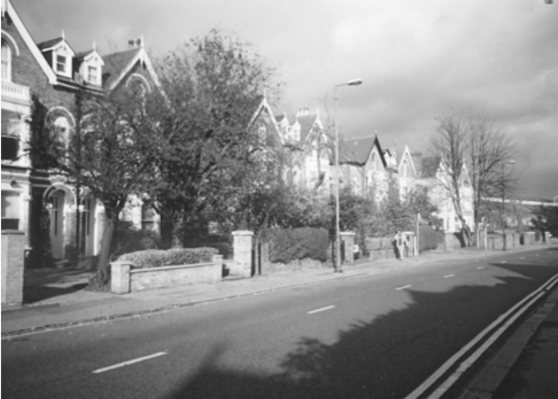
Queen's Road in the spring and summer, showing the contribution which the many mature trees provide to the character of this part of the Conservation Area.