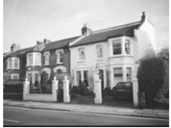
Above, attempts at individuality: left, the white Nos. 57 and 59 with pale green trimmings, and right, No. 65. Below, contrasting front treatments: left, No. 57 and right, the patterned No. 77.