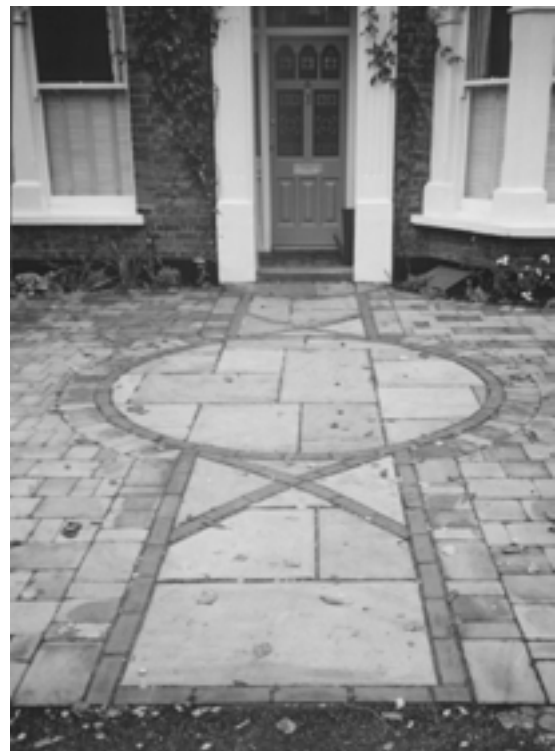
Below: left, the rhythm created by the bays on the convex curve of Queen's Rd; right, No. 109