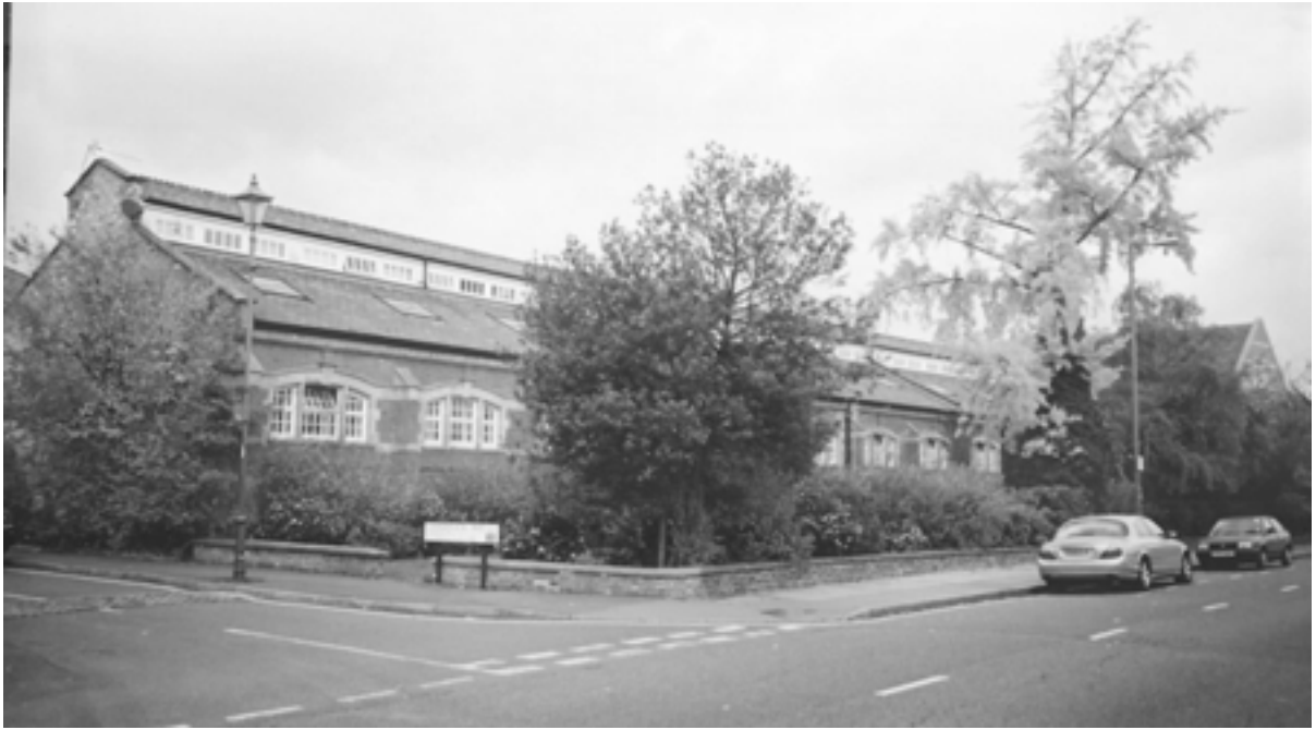
The Queen's Road Depot, now Nos. 76 and 78 Queen's Road and 2 to 72 Radshaw Close. Above, the western arm from Queen's Road. Below: the main entrance from Queen's Road and Radshaw Close. Bottom: the western arm from Radshaw Close, and the eastern end.