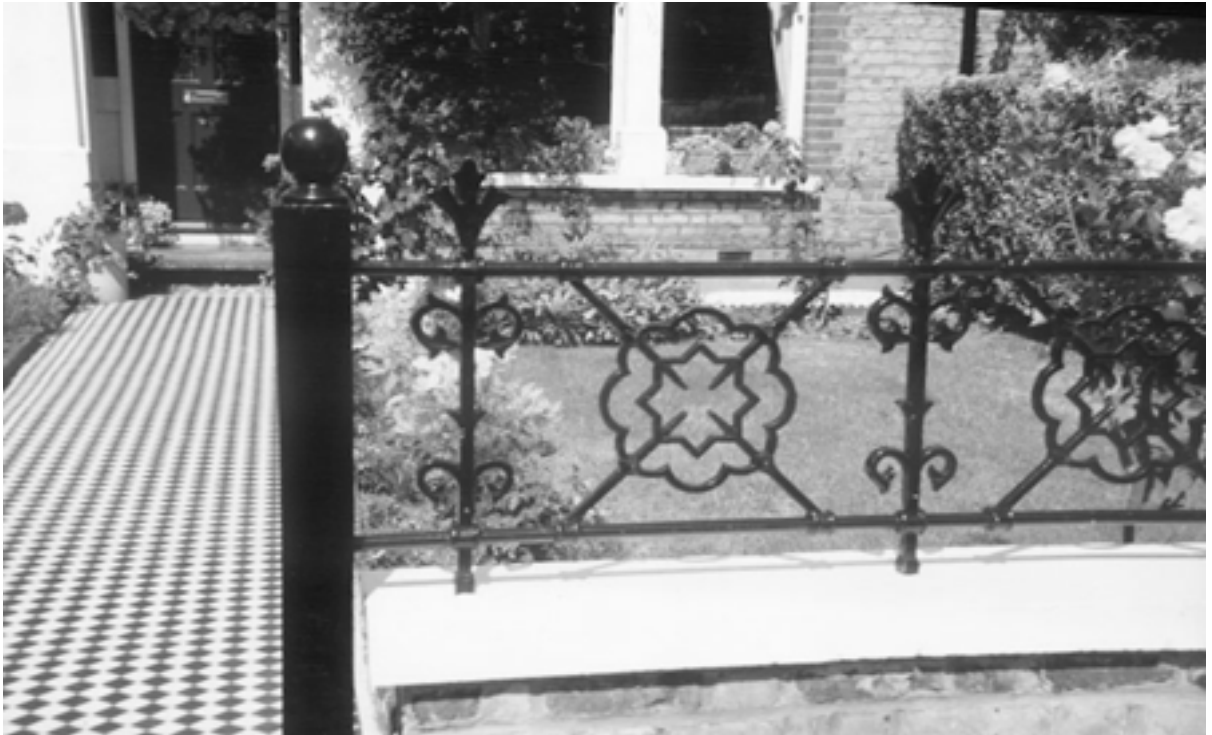
Typical details which help to enhance the character of the Conservation Area: Above, Ornamental railings in King's Road; and below, a stained glass entrance door and geometric tile paving in Prince's Road.