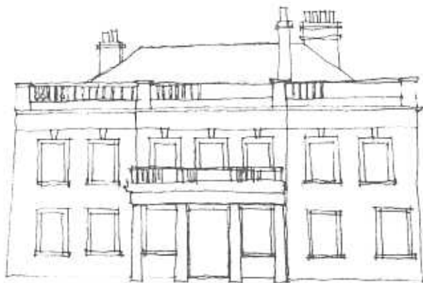
[21] The White Hart Public House

The grade II listed Burn Bullock Public House [20] a former coaching house on the London Road, has a front of early to mid-18th Century and a wing to the left return of 16th-17th Century. It uses yellow stock brickwork with red-dressed window heads under a hipped tiled roof. The three storey five bay front has a central projecting Doric columned porch with modillion cornice. There is a shell porch at the side. The flush Georgian sash windows fit within square gauged headed red brick dressed surrounds, with blind windows to the second and fourth bays at first floor, and to the side. These have been painted to imitate real windows. There are two early 19th century segmental bow windows to the right-hand ground floor bays in small panes with glazing bars. There is a modillion eaves cornice which can be dated to 1911. The timber framed jettied wing to the left return has possible 16th Century chimney stacks to the east and south walls. The interior is impressively panelled.