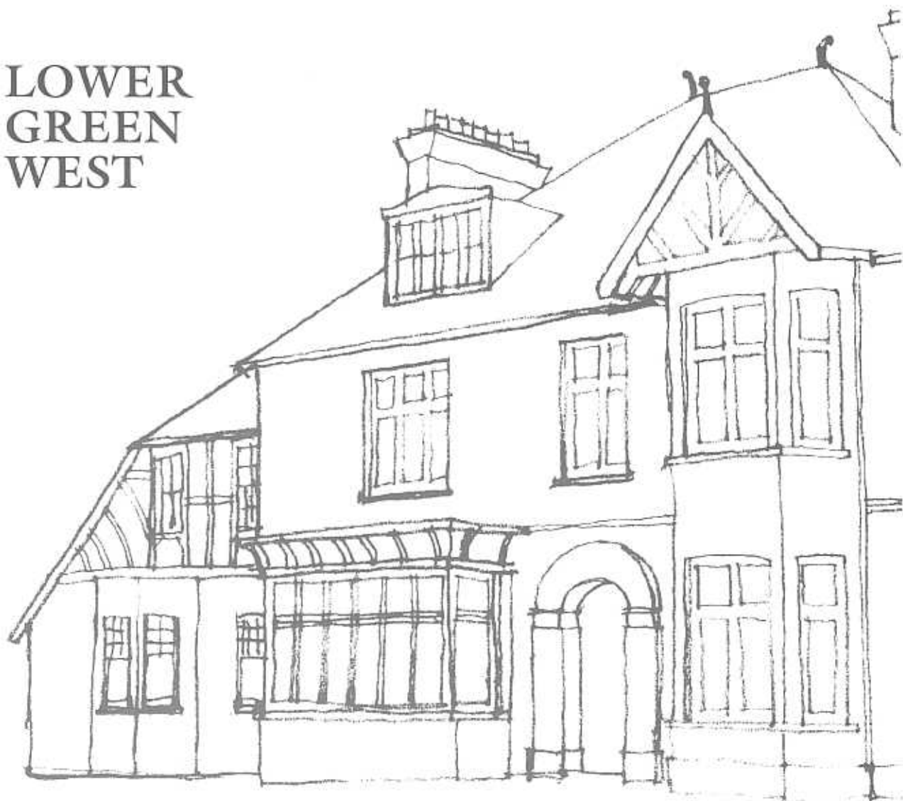
[27] Sibford House

Sitting across the London Road from The Cricket Green, and visually separated from it by the Vestry Hall, The Cricketer's and the Fire Station, this small triangular green provides a transition from Church Road to the London Road. It was reduced to the status of a large traffic island when a one way system was introduced in 1968. The concave line of Preshaw Crescent [24], a white half-rendered terrace under tiled gabled