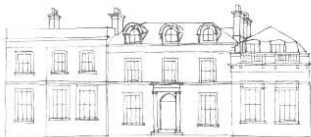
[2] Mitcham Court

The front elevation is composed of three elements, linked by a continuous raised string course at first floor level. The original central three bay unit has a symmetrical facade with a projecting square flat topped porch, with cornice supported on Ionic