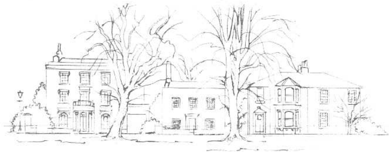
The Cricket Green

A further feature is the horizontal sliding sashes in the three square headed dormers which protrude from the plain tiled roof. The building is surfaced in stucco under a steeply pitched dormered tiled roof.