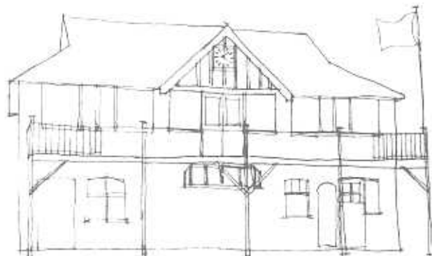
[19] The Cricket Pavilion

The single storey grade II listed Almshouses [17] were erected in 1829 on land formerly occupied by the Tate family's Mitcham house. Financed by Miss Mary Tate for "twelve elderly ladies of good character, regular Church of England communicants and who had never been a charge on the Parish". The Almshouses were built to the design of John Buckler in modified Tudor style in yellow stocks under a slate pitched roof forming three sides of a rectangle facing the Green. The doorways have dressed pointed arches with gauged heads and planked and studded doors. The segmental headed three light windows have timber mullions and diamond windows. A brick eaves