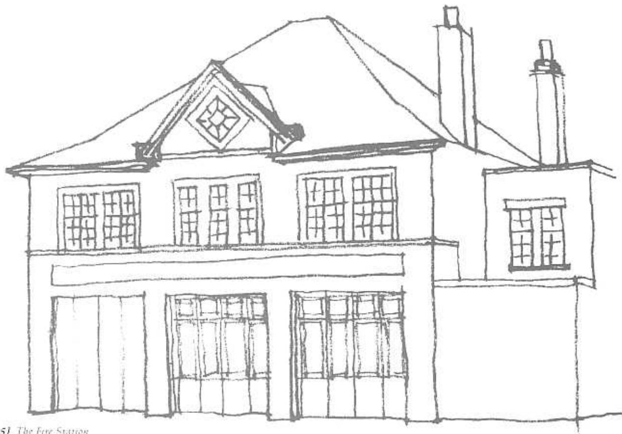
[35] The Fire Station

The adjoining semi-detached Ivy and Elm Cottages [30] are built of red brick under a hipped slate pitched roof with the entrances at the extremities and the recessed sash windows forming a symmetrical pattern. They probably date from around 1800, and are locally listed buildings.