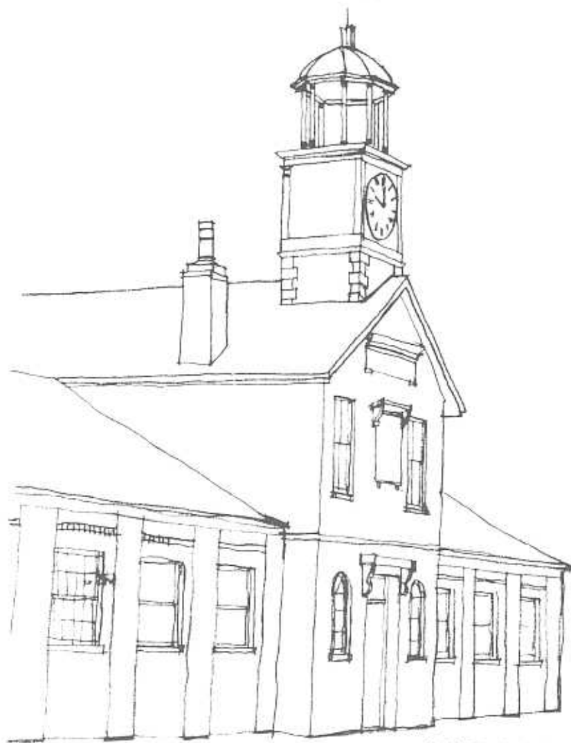
[29] The Parish Rooms

On the west side of the Green, the listed Parish Rooms [29] building of 1788 was enlarged in 1812, when a Day School was established for the education of 'the poor'. Repeatedly extended to accommodate ever-increasing numbers, and regularly condemned by the inspectors as insanitary, it finally closed its doors as a day school in 1897. Subsequently used, not only by a Sunday School, but also for a wide variety of activities until, in 1987 it was sold by the Church and