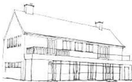
[37] The Cricketers Public House

The Vestry Hall and public house were part of an important commercial area at the turn of the century which could boast a bank, butcher, grocer, dairy, baker, tailor as well as the public houses and local government offices, all grouped at the crossroads where the branch tramway terminated. At that time this was a very thriving area of Mitcham.