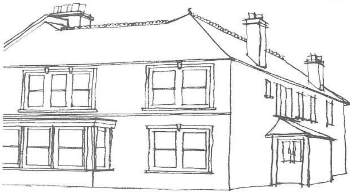
No. 19 Mitcham Park