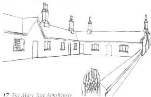
17 The Mary Tate Almshouses

There is a central flat topped porch with moulded cornice, carried on fluted Ionic columns.