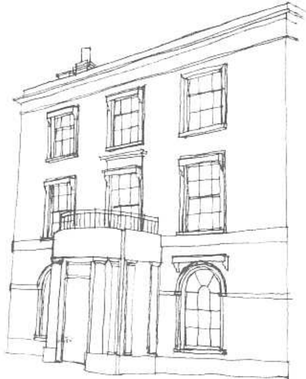
[6] The White House

The grounds at the rear have been recently redeveloped to provide the Freshfields Day Centre [5] a single storey modern brown brick unit under a wide shallow