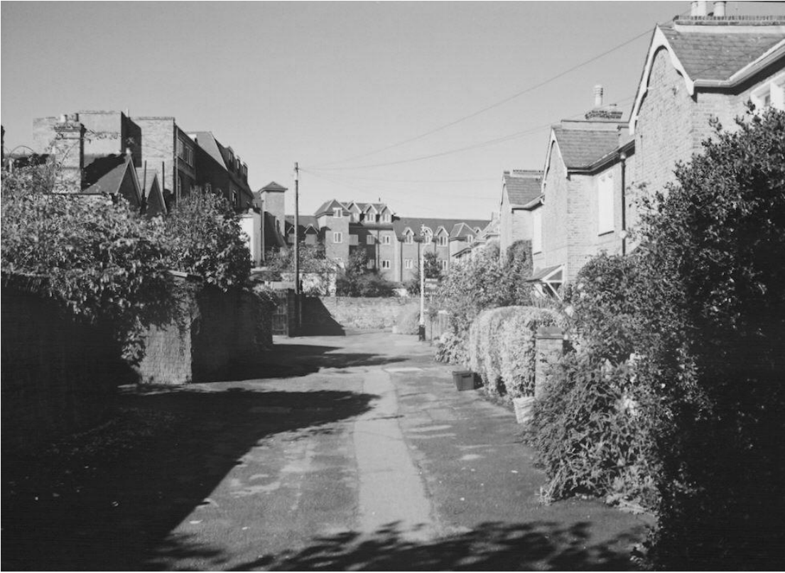
Above: the spatially unresolved 'western square' showing the unattractive vista to the north and the rear gardens to the cottages in Hartfield Road. Below: The 'eastern square' off Gladstone Road, showing its attractive relationship between the space and the adjoining buildings, the termination of the view and the alleyway which leads into the 'western square'.