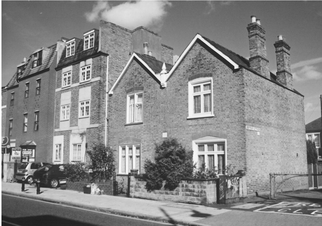
Above: Nos. 100 and 102 Hartfield Road, showing the unsympathetic scale of the buildings immediately to the north. No. 100 was originally numbered 1 Bertram Cottages. Below: Nos. 47-69 Gladstone Road, showing the context of the Bertram Cottages Conservation Area.