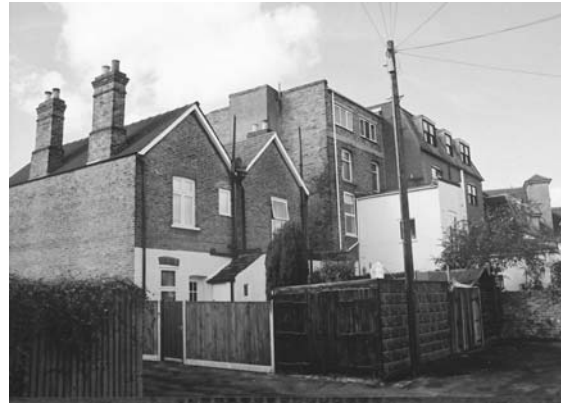
Examples of vehicular intrusion. Above, the western square: the use of the back garden to No. 110 Hartfield Road as a car park, and the unsightly garage at the rear of No. 102 Hartfield Road. Below: ways of accommodating cars into the front and back gardens to No. 57 and 59 Gladstone Road.