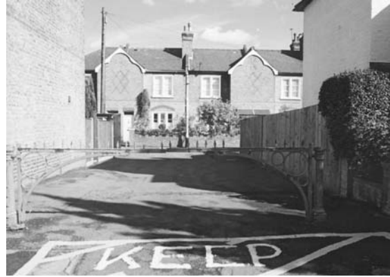
Above: The barriers to the two squares which contribute significantly to the townscape. Below: Left, Nos. 17 and 18 Bertram Cottages showing a typical front elevation. Right, the cycle barrier at the eastern end of the passageway between the two squares.