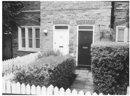
Above, the uncoordinated front garden treatment to Nos. 7 to 14 compared with the neat front gardens to Nos. 35 and 36. Below, the non-standard front doors to Nos. 59 to 61 Gladstone Road, and 112 to 114 Hartfield Road, which do not form part of the original scheme.