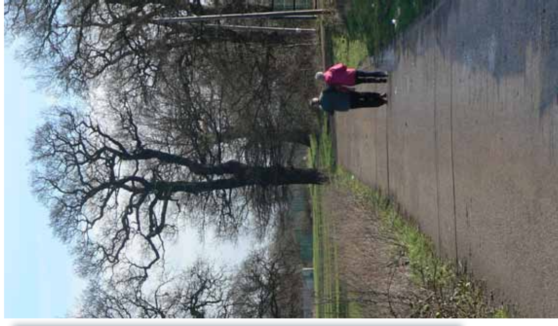
Prince Georges Playing Field