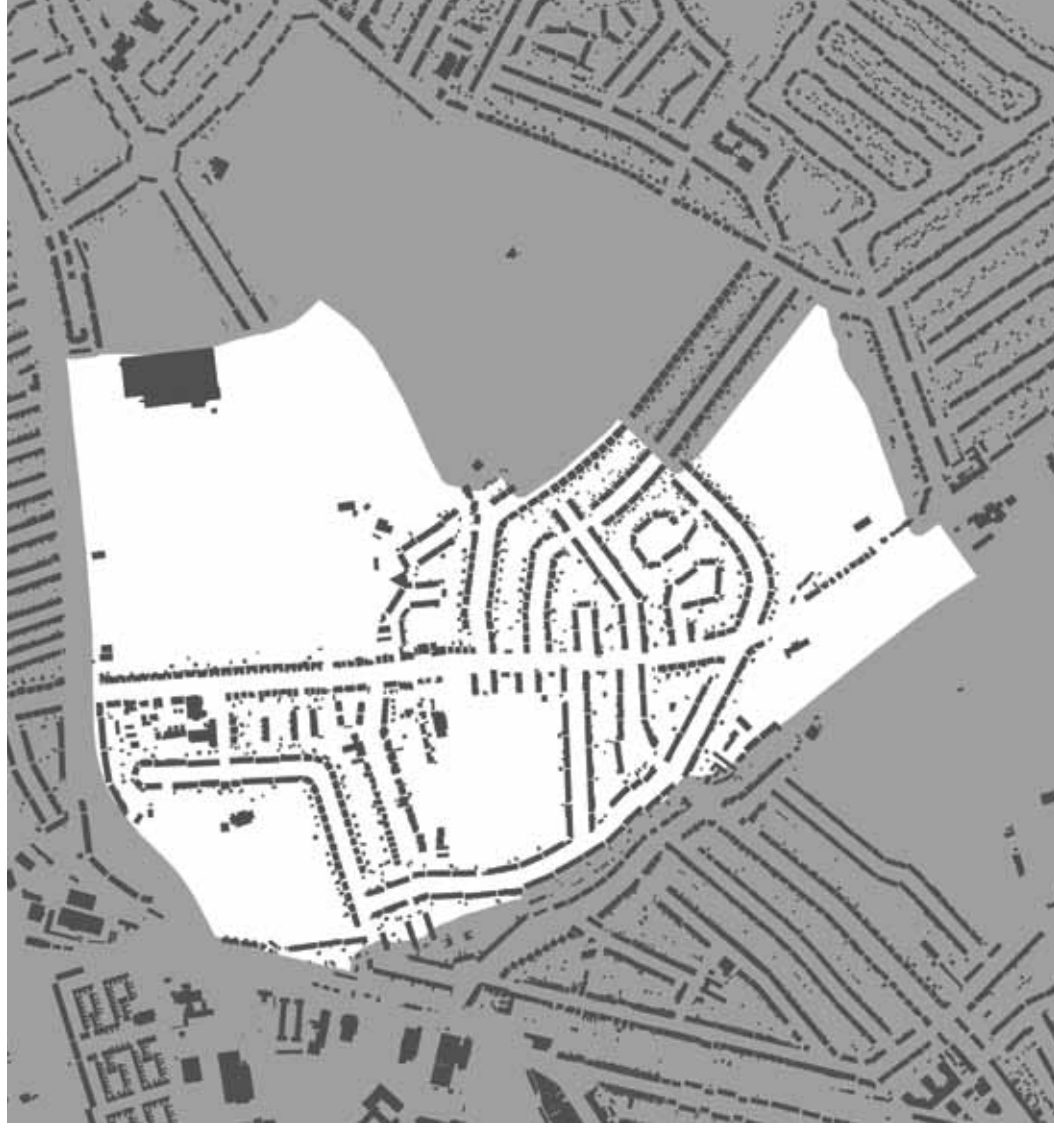
Figure Ground of Grand Drive Neighbourhood

The majority of houses in the area consist of short terraces, originally with leaded light windows, open porches linked to front bays with three vertical timbers in the gables. Small areas of consistently detailed semi detached properties break the pattern at Linkway and Heath Drive, with substantial Edwardian villas in Blenheim Road. The northern part of Grand Drive has a distinctive character defined by the combination of St. Saviours Church and the well detailed villas opposite. To the south, the layout of Bijou Villas on the east side of Grand Drive, overlooking open space, contrasts with the formal planned layout of the streets to the north.