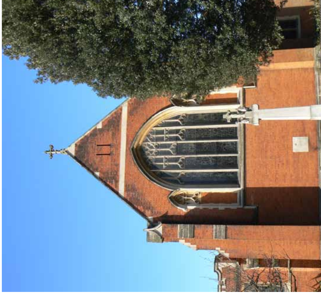
St. Saviour Church

The recreation grounds within the area make a key contribution to the area's character. Prince Georges playing field provides open views from Bushey Road when approaching the neighbourhood from the east. This openness is in stark contrast to the tight and formal layout of terraced housing to the north of Bushey Road. The open space adjacent to Westway Close also has strong visual amenity value, being directly overlooked by the houses. Similarly, Bijou Villas and the adjacent houses on the eastern side of the lower part of Grand Drive benefit from their situation with glimpsed views of the open space opposite. A smaller area of open space on Crossway also contributes to this open character that characterises some parts of the street scene.