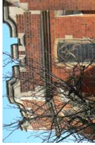
St. Saviours Church