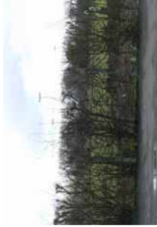
View to open space