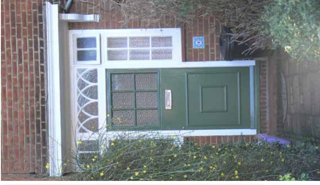
Grand Drive Detail