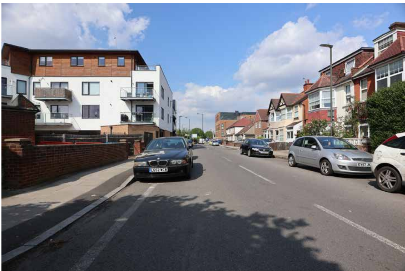
Burlington Road / Claremont Avenue