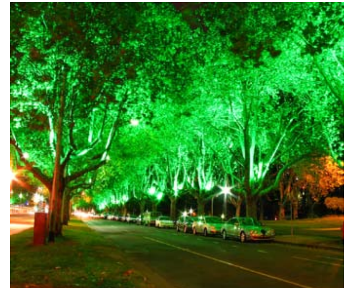
Lighting of trees along strategic routes can highlight existing assets and add visual interest.