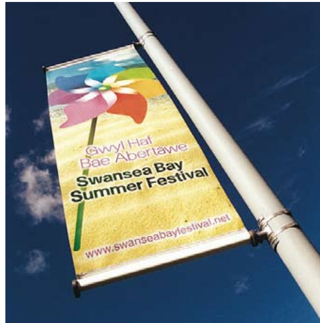
Banner advertising integrated with light columns

Banners to promote local events should be fixed to lamp posts. A simple double-sided rectangular banner of a standard dimension of 500x1500mm should be used throughout the borough for ease of use, and visual clarity. The finish of the fixing arms should match the lamp pole and should be demounted when banners are not displayed. Graphics used on the signs should be consistent within each town centre at a given time.