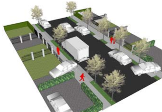
Examples of suitable front garden parking provision

The area of hard surface should be limited to the absolutely necessary and as much planting as possible should be retained.