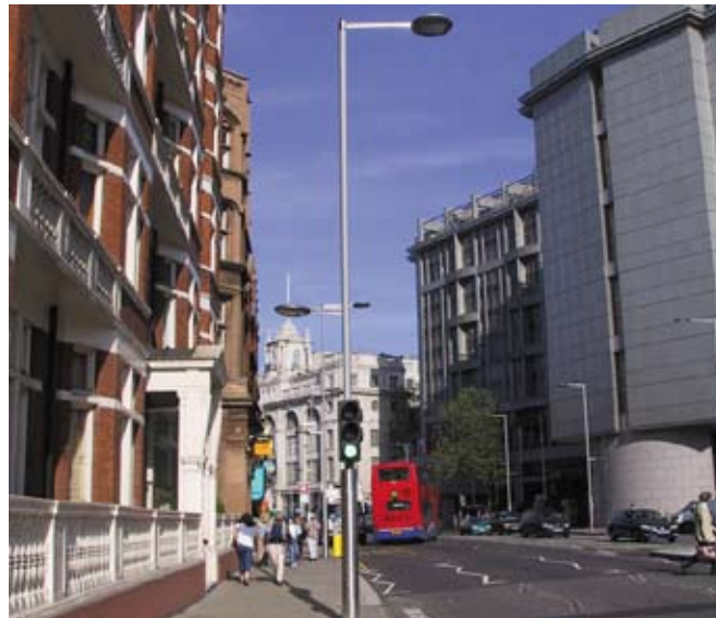
Combined lighting and signal poles can significantly reduce street clutter. Note pedestrian oriented lamp in areas of high traffic.