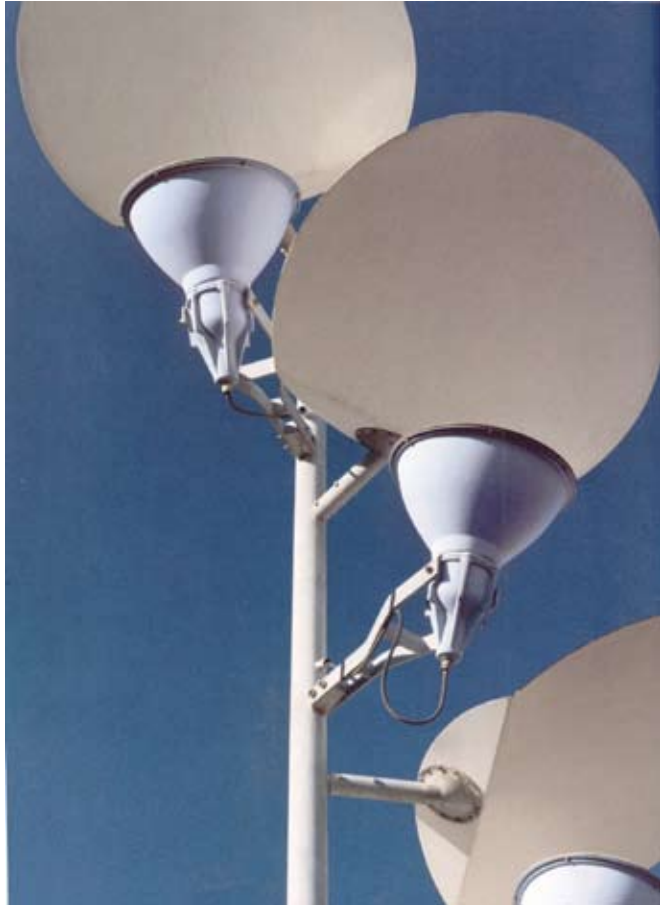
Multiple fixtures on poles can assist with clutter reduction