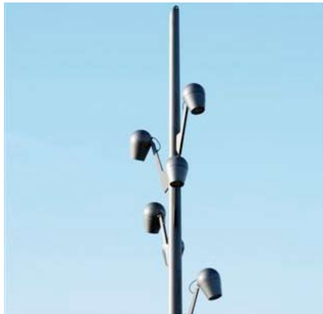
Multiple fixtures on poles can assist with clutter reduction

The introduction of lighting in the public realm can increase the perception of safety in the area. In addition, the introduction of CCTV cameras to streets and spaces has been proven to reduce vandalism and crime. By integrating lighting solutions with monitoring equipment and help buttons, an area's safety is substantially increased.