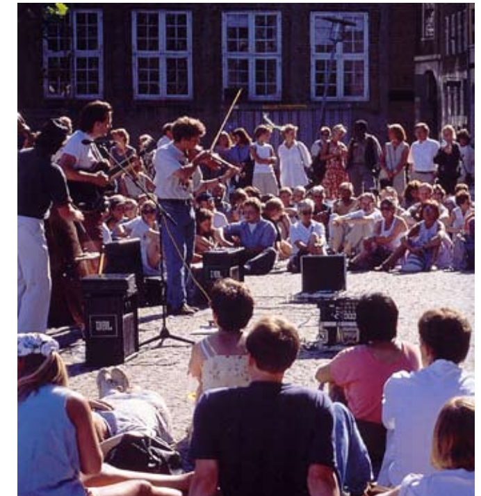
Flexibly designed spaces allow for events to take place

Where any street and outdoor cultural events are programmed to occur, suitable power sources will be offered to power such events. Suitable paving materials will be considered that can withstand food spillage and staining where street events may occur for a reasonable length of time.