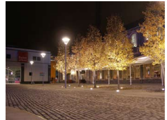
Inground uplighters can highlight trees