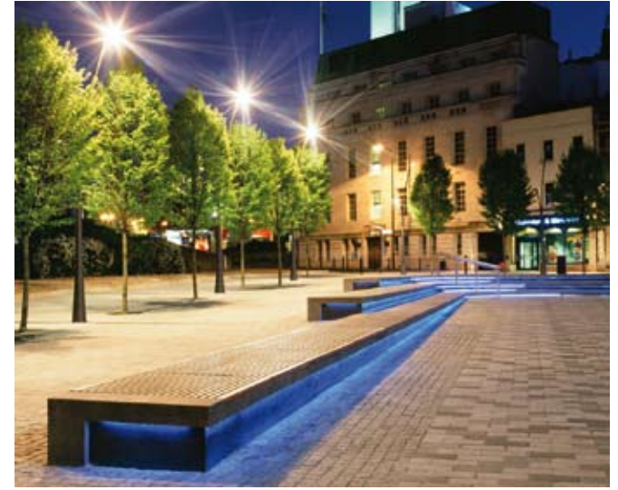
Coloured lighting can be integrated into design to highlight structures