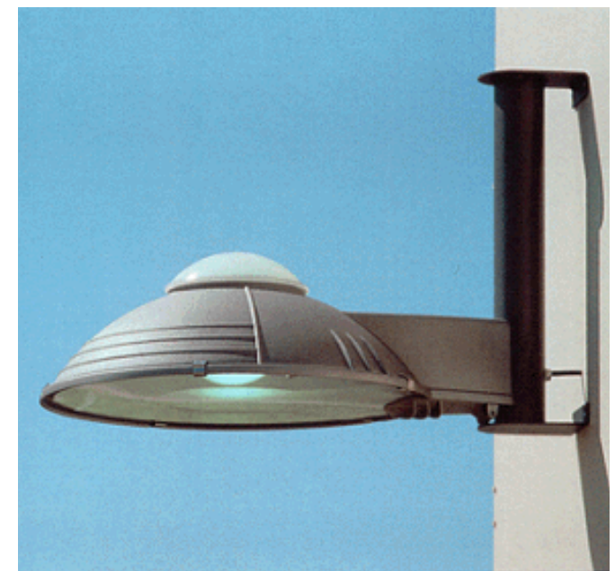
Wall mounted fixtures can also reduce clutter