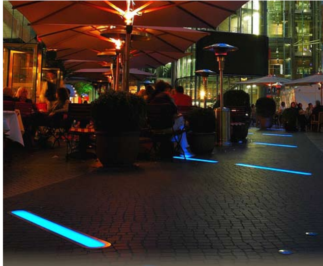
In-ground lighting can highlight an important space