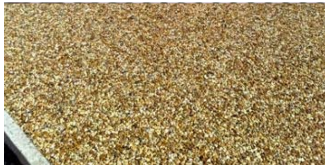
Permeable gravel paving