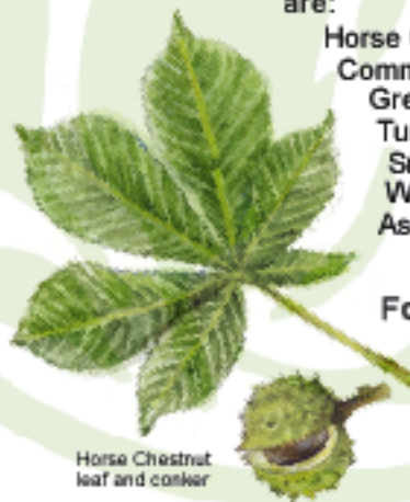
Horse Chestnut leaf and conker

Horse Chestnut, Common Lime, Grey Poplar, Turkey Oak, Snowberry, Wild Privet, Ash.