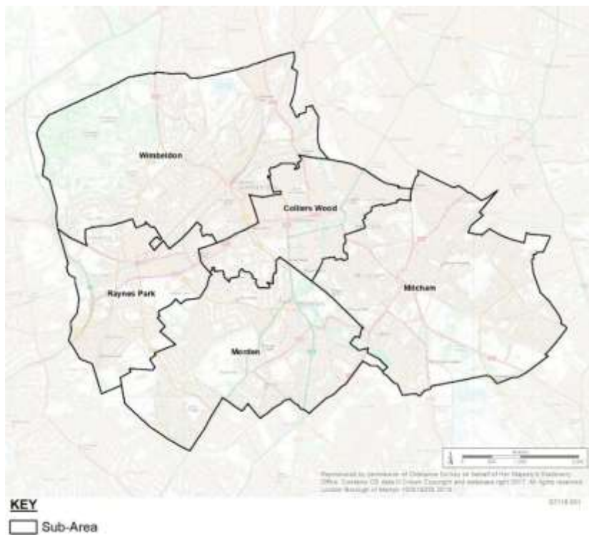
Figure 3: Merton Sub-Area Map