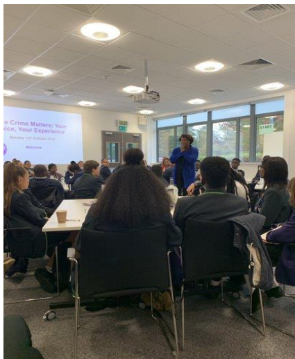
'Hate Crime: Your Voice, Your Experience Matters' event for students at Merton College, October 2019

In 2021 the launch event focused on a panel of speakers discussing the national theme of Transgender hate crime. This was combined with a session focusing on working together against race hate crime, a coffee morning with the Polish Family Association and an engagement stall at the Baitul Futuh Mosque, Morden.