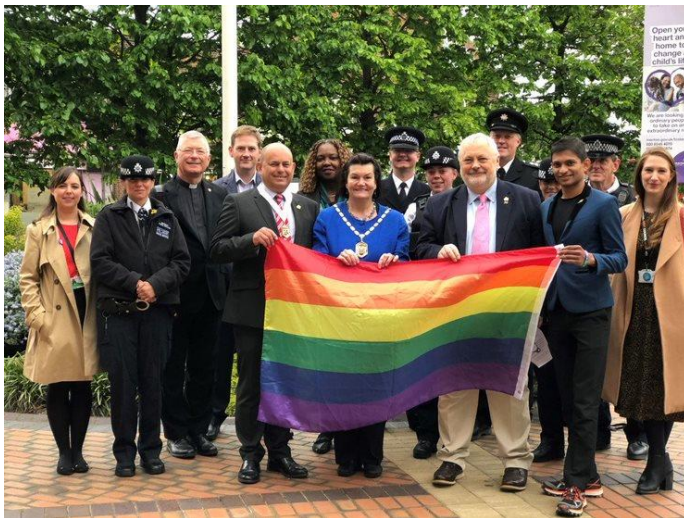
IDAHOBIT 2019, Merton Civic Centre

This important day has been marked in Merton each year since 2017, with a rainbow flag raising ceremony attended by police and partner organisations to show solidarity with our LGBTQ+ residents and encourage those who have become victims of hate crime and intolerance to come forward and get the support they need.