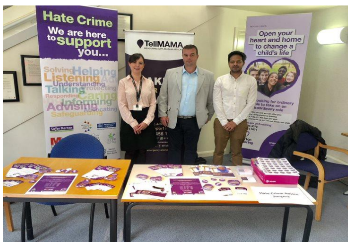
Merton Hate Crime Advice Surgery, Merton Civic Centre

In 2019 Merton became the first borough in south London to host a monthly Hate Crime Advice Surgery, in partnership with Tell MAMA and other community organisations working with victims covering each strand of hate crime. The surgeries are a confidential drop-in service for victims of hate crime to be offered advice and support.