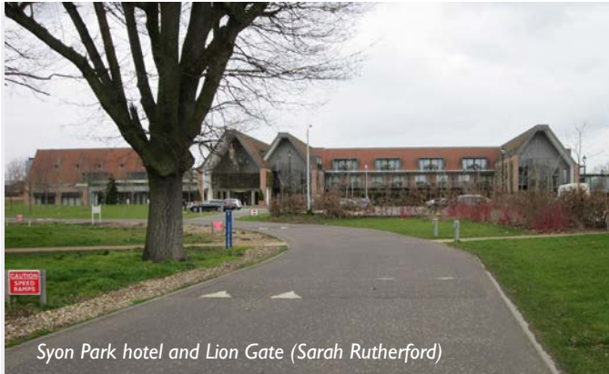
Syon Park hotel and Lion Gate