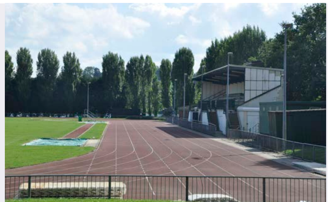
Wimbledon Park (London, II*) is in divided ownership with no agreed site wide masterplan to protect the heritage. It has become dominated by sports facilities and is under constant pressure. The athletics track and poplars obscure the lake. It is on the Historic England Heritage at Risk Register. (J&L Gibbons)