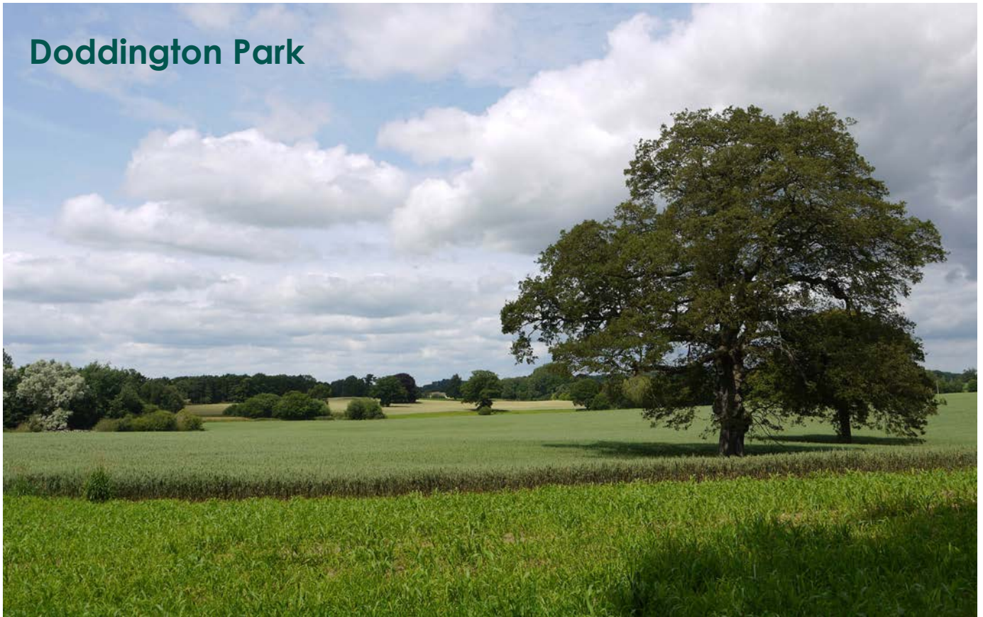
Doddington Park (East Cheshire, II)