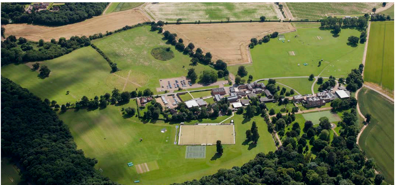
An accretion of school buildings, sports facilities and arable fields detract from the character of Langley Park, Norfolk. In 2009 the Garden History Society wrote of their regret 'that there has been ad hoc and detrimental development at Langley School over the years, leading to a significant degradation of its important historic landscape asset.'

Institutions require the flexibility to respond to ever-changing demands within tight budgets, making it hard to follow a long term masterplan. If heritage is not their core purpose it is relegated as a priority. The incremental impact of frequent and often large-scale change associated with institutions, especially educational and medical, can be severe. The landscape is commonly seen as a sacrificial element in achieving the core goals of the institution when it requires new infrastructure, and in preserving the listed historic buildings, which form a perpetual drain on resources. Educational bodies often need to upgrade facilities, enlarge campuses and car parking, and provide new accommodation. The attrition rate is high, with a constant stream of applications that builds into major damage to Brown's work.