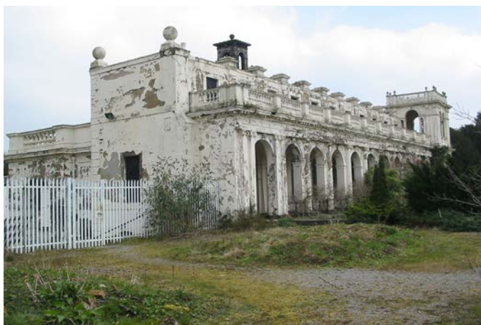
Above and below: Trentham (Staffordshire, II*)

Wimbledon Park (London, II*) is a rare Brown urban park which faces conflicting demands from sports, leisure, nature conservation and heritage; it is under pressure from intensive uses as well as development in its setting. The park is on Historic England's Heritage at Risk Register and illustrates many of the pressures facing sites with divided ownership and lacking co-ordinated management.