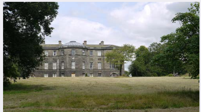
The oak nearest the hall has been confirmed as Cheshire's champion Quercus cerris, dating to the eighteenth century

Unfortunately experience shows that one enabling development is often followed by another, which may happen in this case, often resulting in devastating damage to Brown's designs.