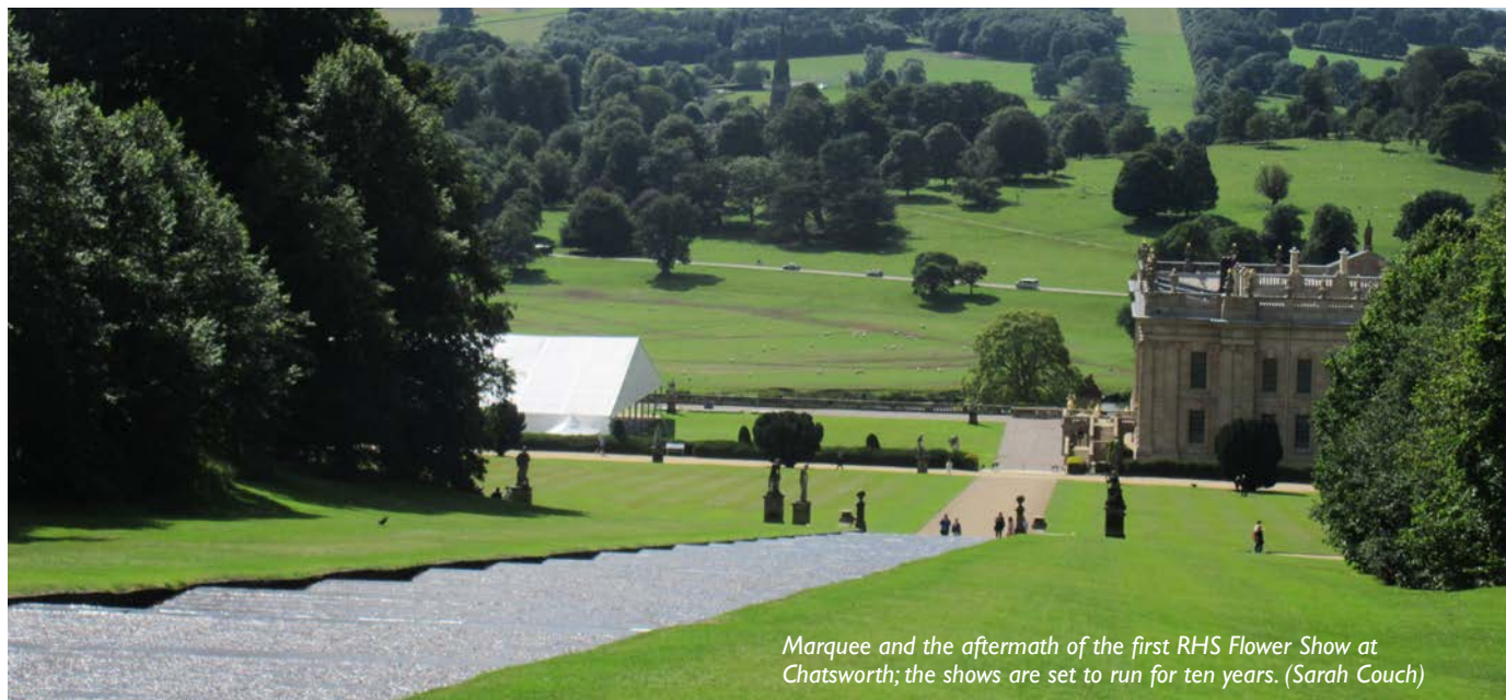
Marquee and the aftermath of the first RHS Flower Show at Chatsworth; the shows are set to run for ten years. (Sarah Couch)

Temporary events seem an easy financial win for owners as they struggle to keep Brown's parks afloat. However, the indirect cost comes from the effect of large numbers of visitors, cars, coaches and catering, causing long-term damage to the fabric and aesthetics of the 'soft' landscape ranging from compaction and damage to trees and archaeology to near-permanent marquees: not all the damage is reversible.