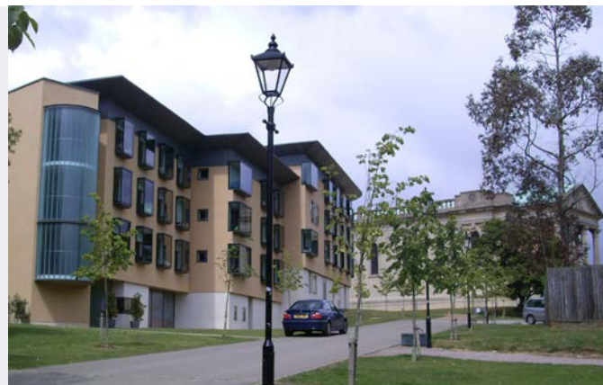
Left: multiple buildings in the divided park at Fawley Court, (Bucks, II*) on the Heritage at Risk Register and in divided ownership. Right: new school building visible from the Temple of Venus at Stowe (Bucks, Grade I) (Sarah Rutherford)