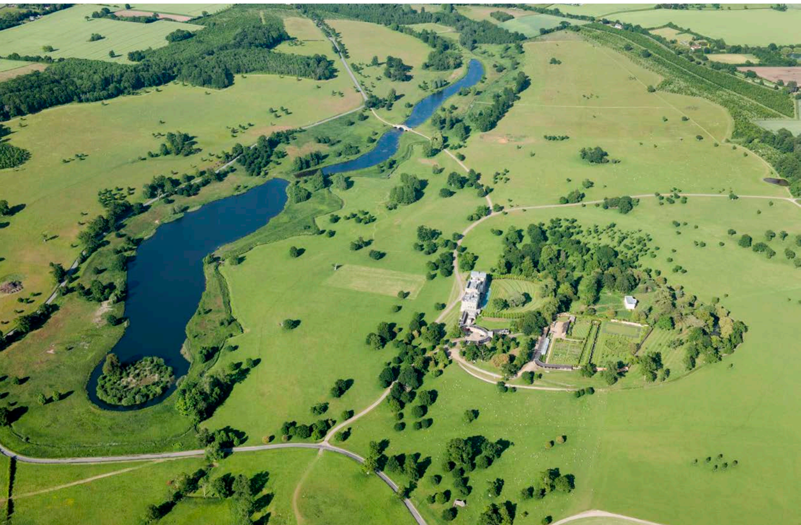
Heveningham Hall (Suffolk, registered Grade II*) is a classic Brown landscape. In 1781 Lancelot 'Capability' Brown was commissioned to improve the grounds here in his last two years. It remains in private ownership as a family home. The present owner has over the last two decades restored the Grade-I listed hall and returned the landscape to Brown's design including purchasing former parts of the estate to reassemble the park and implementing the Brown-designed serpentine extension to the lake.