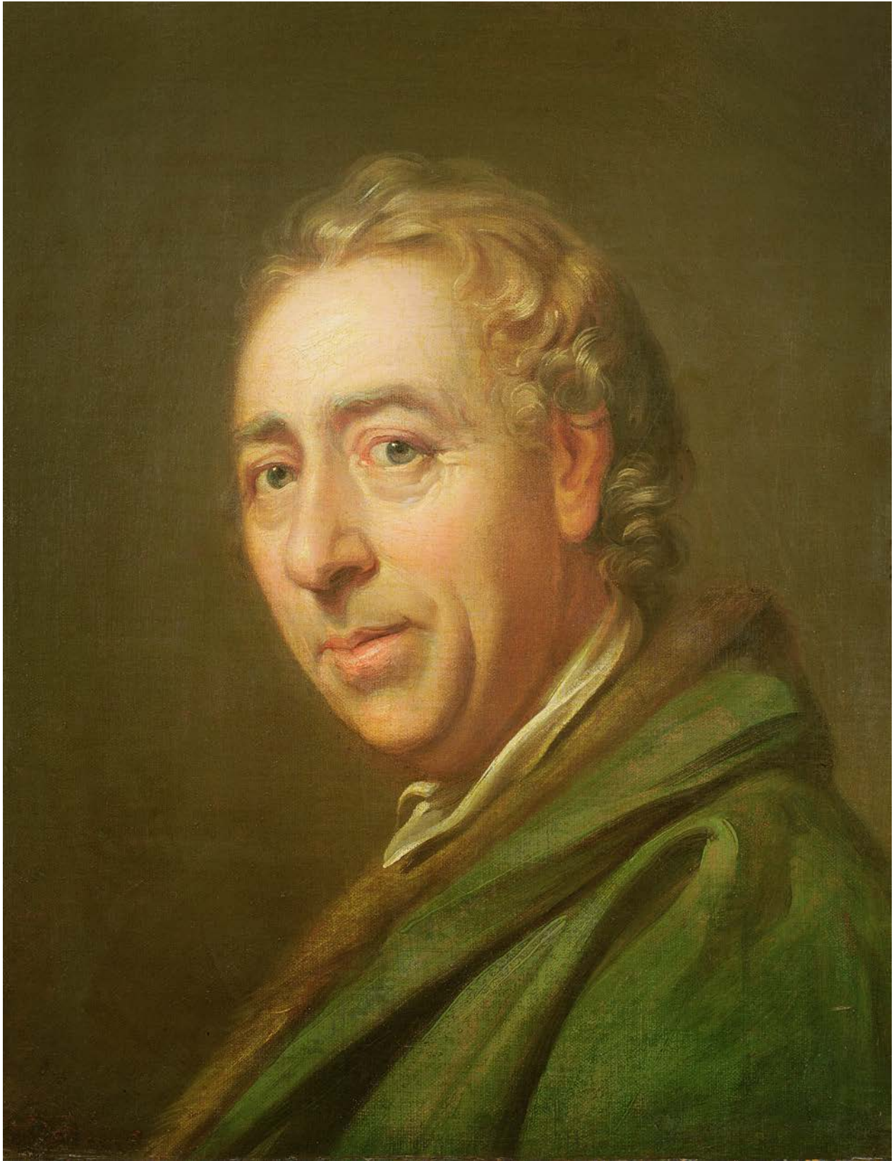
Portrait of Lancelot 'Capability' Brown, c. 1770-75, Cosway, Richard (1742-1821)

Cover image: aerial photograph of Moor Park, Hertfordshire, showing the impact of golf courses and parking on the Brown landscape.