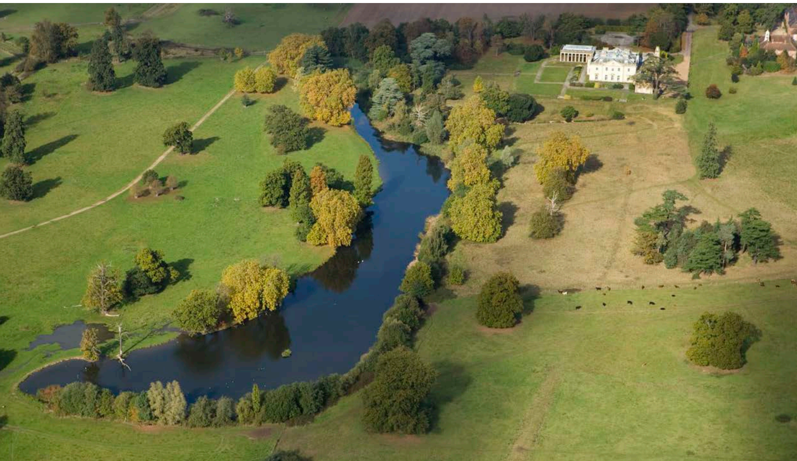
Langley Park (Buckinghamshire, 11): a country park restored with the help of the Heritage Lottery Fund.