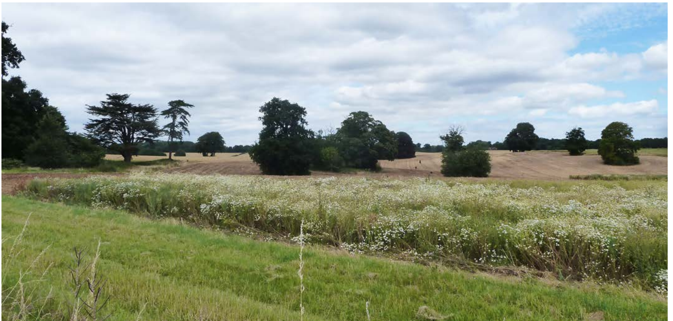
Arable fields on former parkland at Beechwood (Hertfordshire, unregistered). Changing land use can have a major impact on a park's character. (Kate Harwood)

Some of the vital features of a Brown landscape, such as its views, disposition of planting and grazed pasture, as well as setting, may not be covered by development control