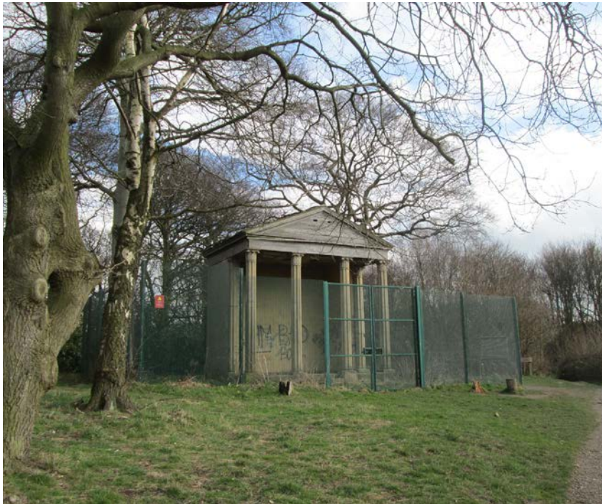
The derelict temple in the public park at Temple Newsam (Yorkshire, II) (Sarah Rutherford)

Rear cover image: aerial photograph of Aynhoe Park (Northamptonshire, Grade II) Development is proposed in the foreground and large swathes of parkland have been converted to arable with the loss of many important trees (© Historic England Archive 29871-021)