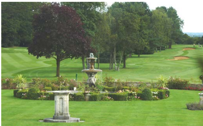
Fairway in main vista near the house at Moor Park (Hertfordshire, II*). The great extent of the golf course and associated non-Brown planting and parking are shown on the cover photograph. In 2017 there was an application for yet more parking. (Kate Harwood)

The decision notice stated: It is considered that, due to the inappropriate position and design, the proposal would result in an incongruous addition to Syon Park which would fail to preserve or enhance both the setting and the special architectural and historic character of the Grade I Listed Syon House and the Grade I Registered Park and Garden ... and it is considered that, due to the extent of development already in situ which contributes towards the restoration and maintenance of the heritage asset, the proposal is not appropriate enabling development to secure the future of the heritage asset'.