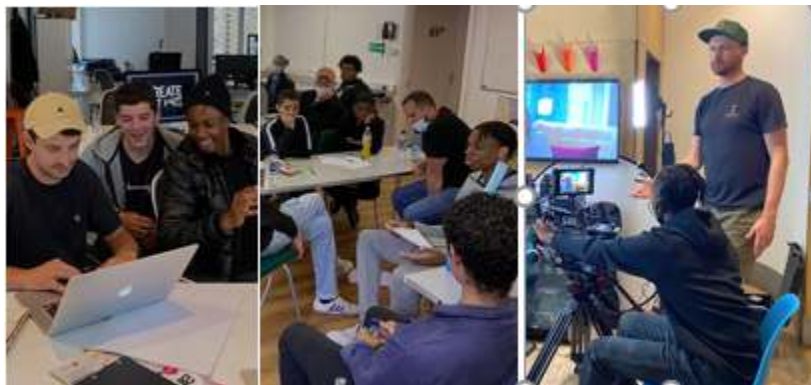
YPs working with Quiet Storm on the Create Not Hate campaign.

In terms of current and future projects, Towards Employment has job-clubs and employment pathways being set up with the railway industry (potential HS2 jobs), Groundworks and guaranteed interviews at Just Eat utilising their electronic bikes to assist with fleet decarbonisation goals. The team is also working with Met Police to deliver 3 sessions on young people’s experiences with Stop and Search to be filmed for social media and potential broadcast.