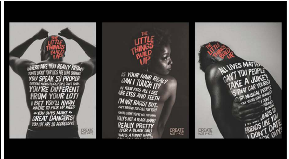
Billboards that were across London.