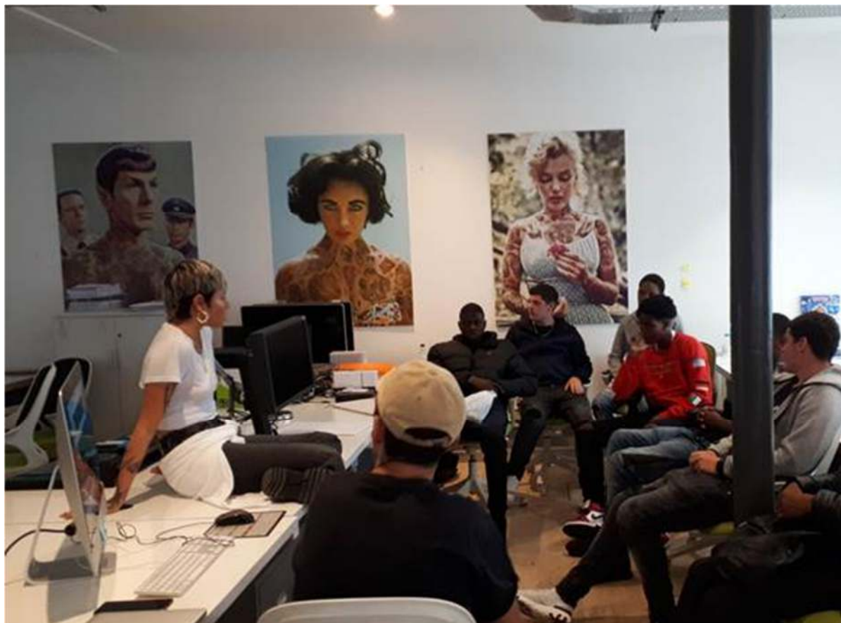
YP at Quiet Storm offices in Soho taking part in graphic design master class

Other key parts of the programme include the provision of CV, application and interview preparation support (56 young people). 27 job interviews have been secured to-date including 17 job or apprenticeship starts during lockdown and 12 young people have undergone construction skills certification scheme (CSCS) card training.