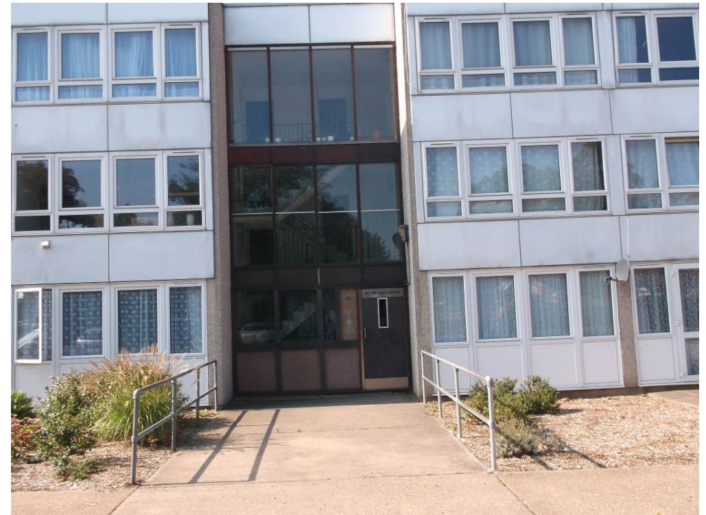
Photograph 5 – Typical block of flats