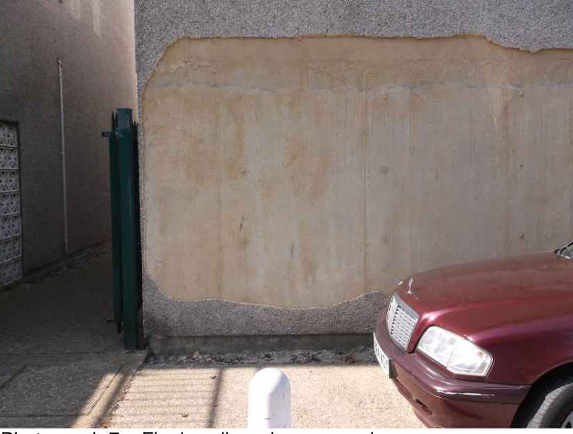
Photograph 7 – Flank wall render removed