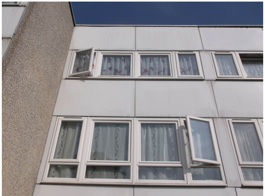
Photograph 13 – Paines Close – Rear elevation