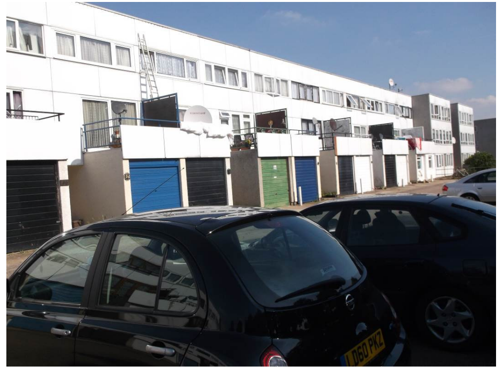
Photograph 1 – Town houses – front elevation