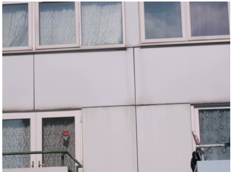
Photograph 3 – Typical cladding to flats