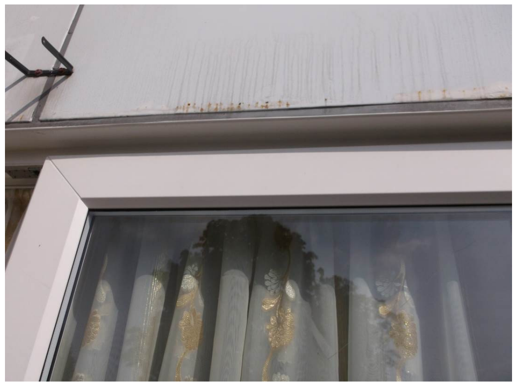
Photograph 14 – 18 Paines Close – Cladding and windows at rear