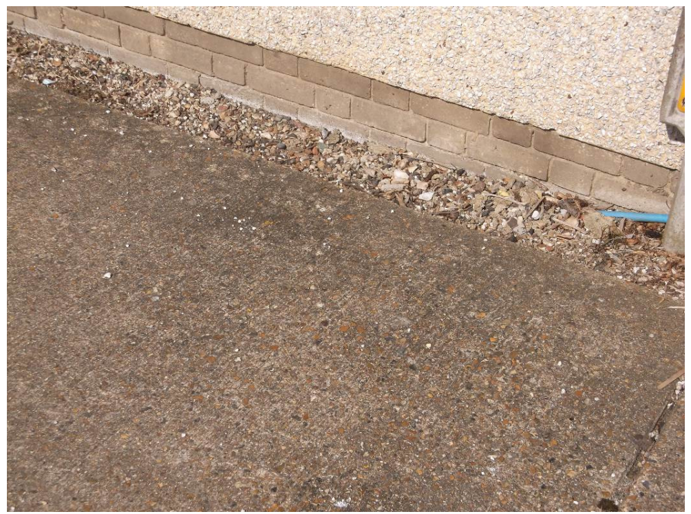
Photograph 4- Base of flank wall