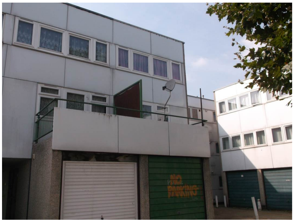
Photograph 12 – Front elevation 18 Paines Close