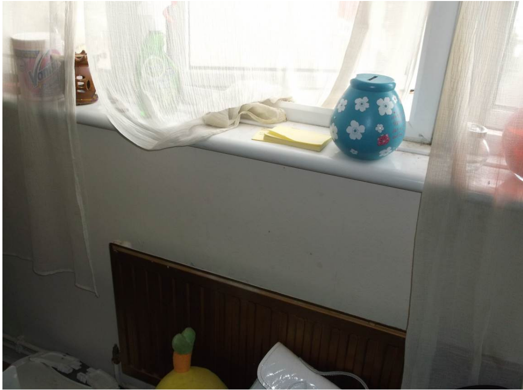
Photograph 11 – Typical panel below windows in flats