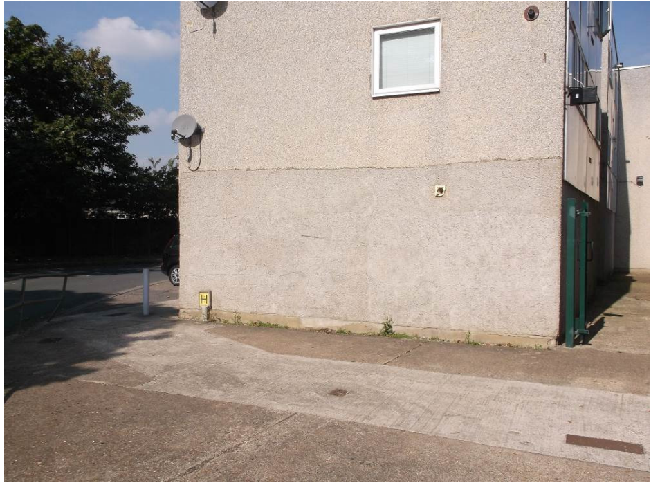
Photograph 9 – Flank wall rendered