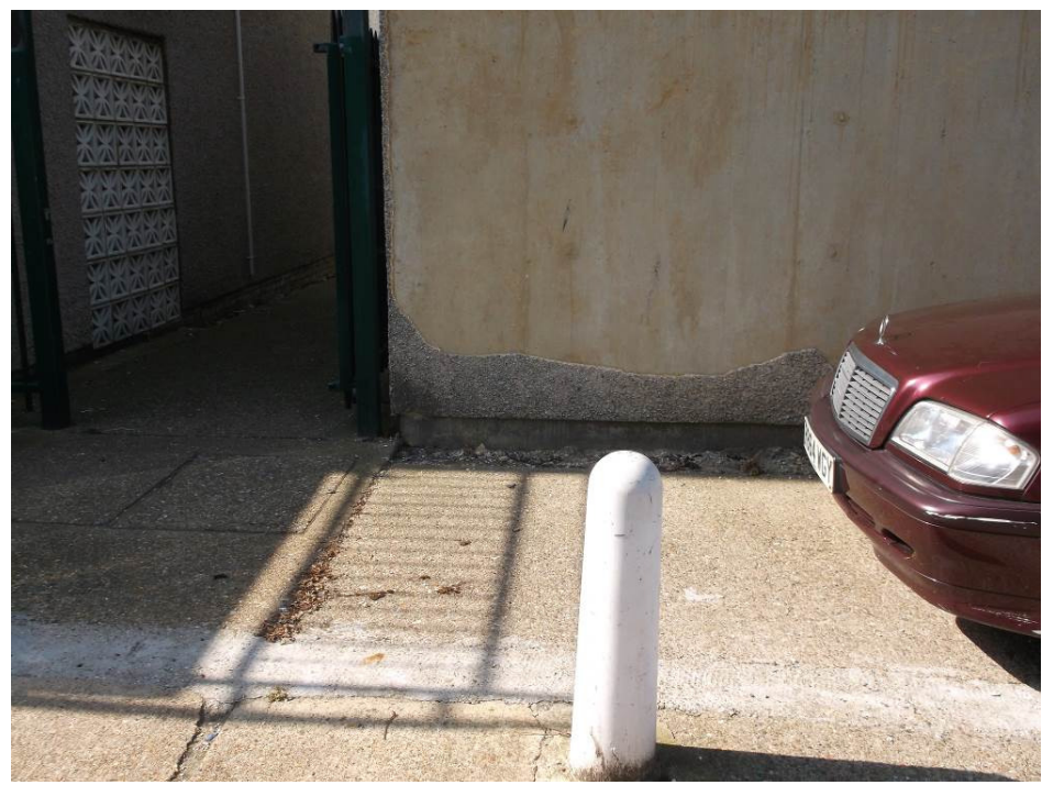
Photograph 8 – Flank wall render removed