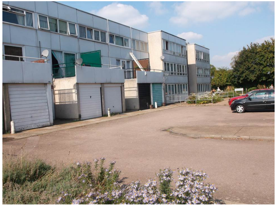
Photograph 6 - Town Houses