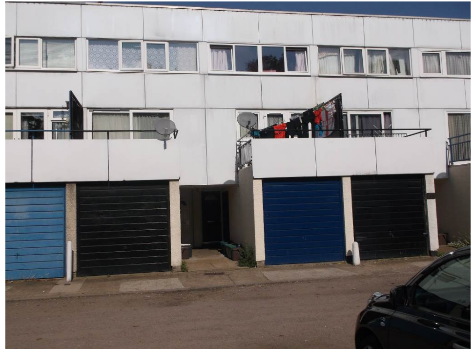
Photograph 2 – Town houses – front elevation