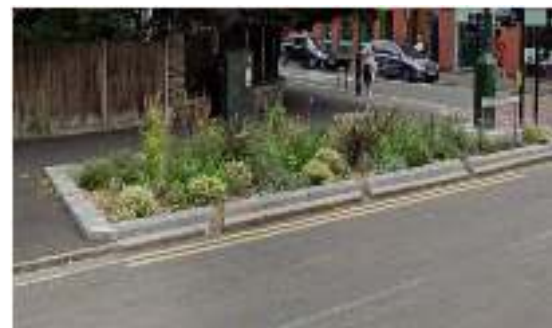
Raingarden - cnr Wimbledon Hill Road and Woodside, completed June 2021