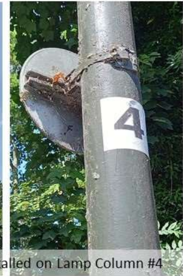
CCTV Camera Installed on Lamp Column #4