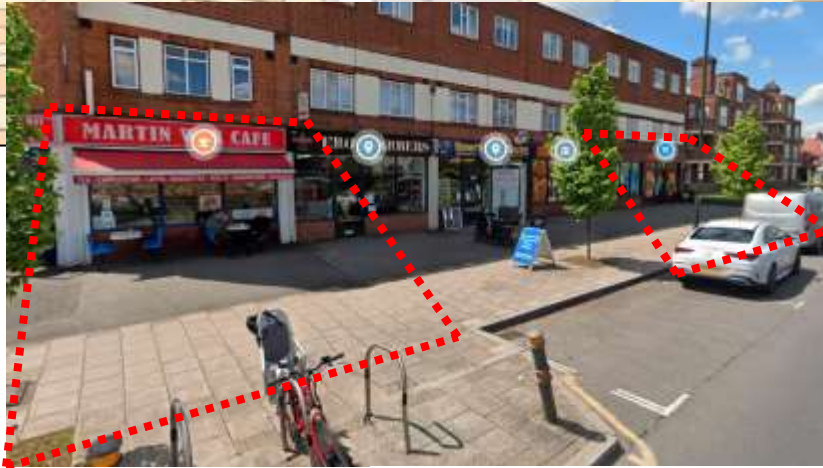
Proposed locations for 2x planters.