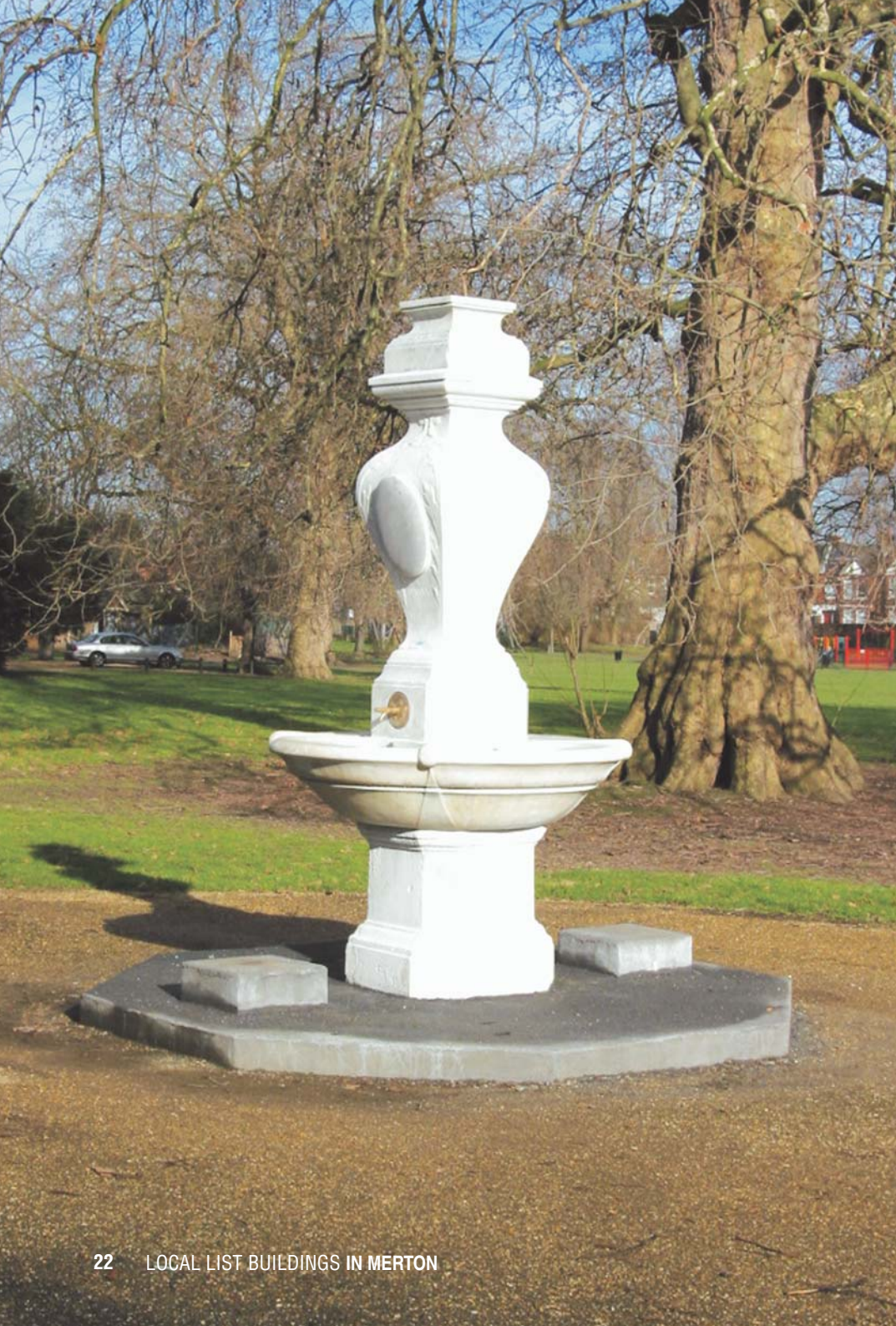
Sculpture at Wandie Park, Colliers Wood.

If you would like more information in your own language, please contact us via the details indicated in the box below