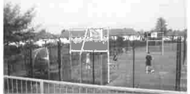
King Georges new ball court - 10:05:06

Communal gardens such as areas with planting and seating suitable for picnicking and where ball games might be prohibited.