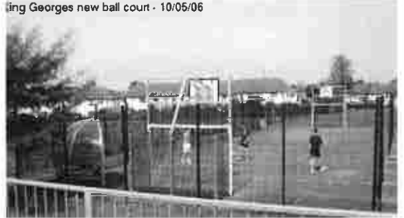
King Georges new ball court - 10/05/06

Communal gardens such as areas with planting and seating suitable for picnicking and where ball games might be prohibited.