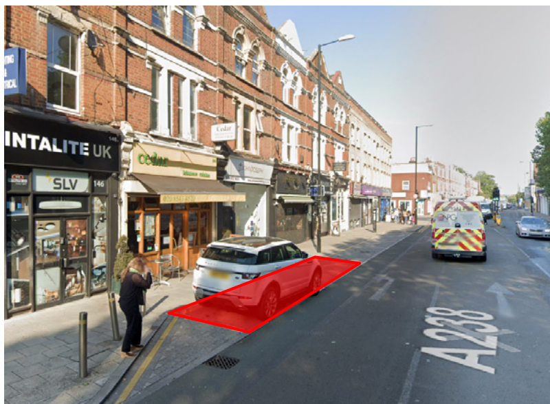
Location of parklet structure highlighted in red

The order will come into effect on Friday 9th July 2021 and remain in place for no more than 18 months. The consultation will be open for 6 months. Please use the online service to provide feedback on the Council's website below.