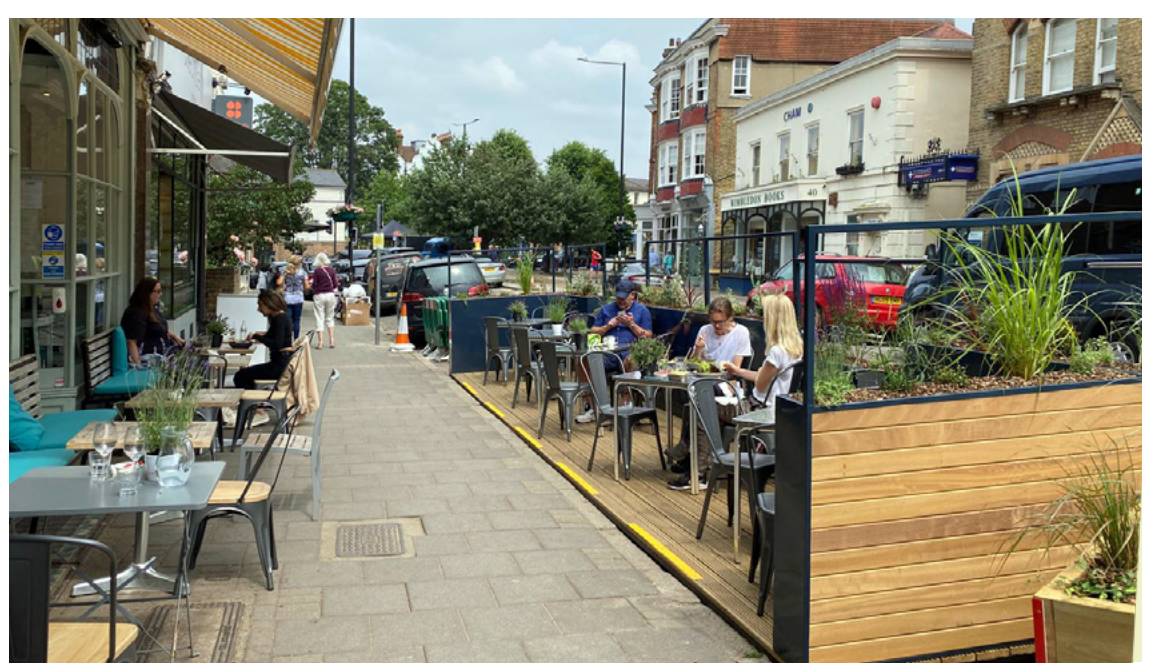
The first parklet of 8 delivered on the High Street, Wimbledon

The council are working with FM Conway and Meristem Design to design and deliver this exciting initiative across the borough.