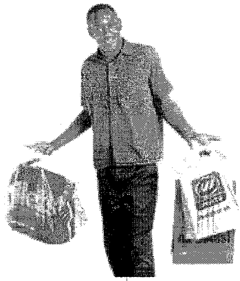
The local economy