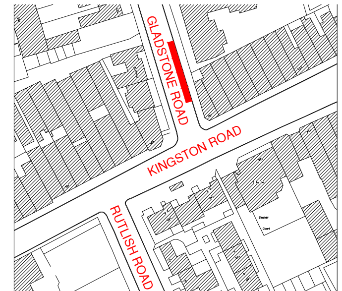
SITE LOCATION PLAN - 1:1250