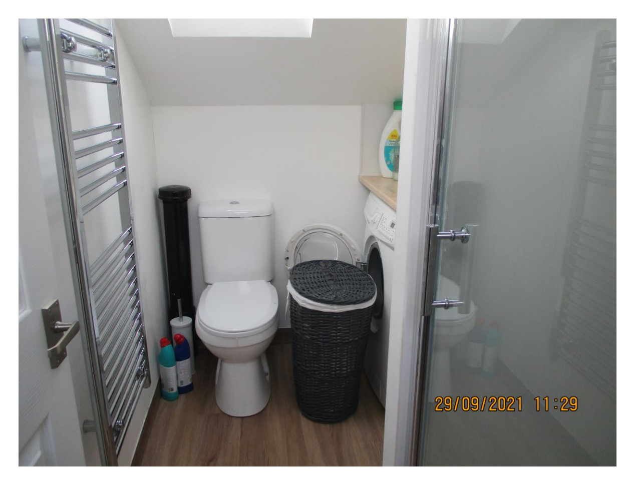
Figure 2 studio bathroom and washing machine