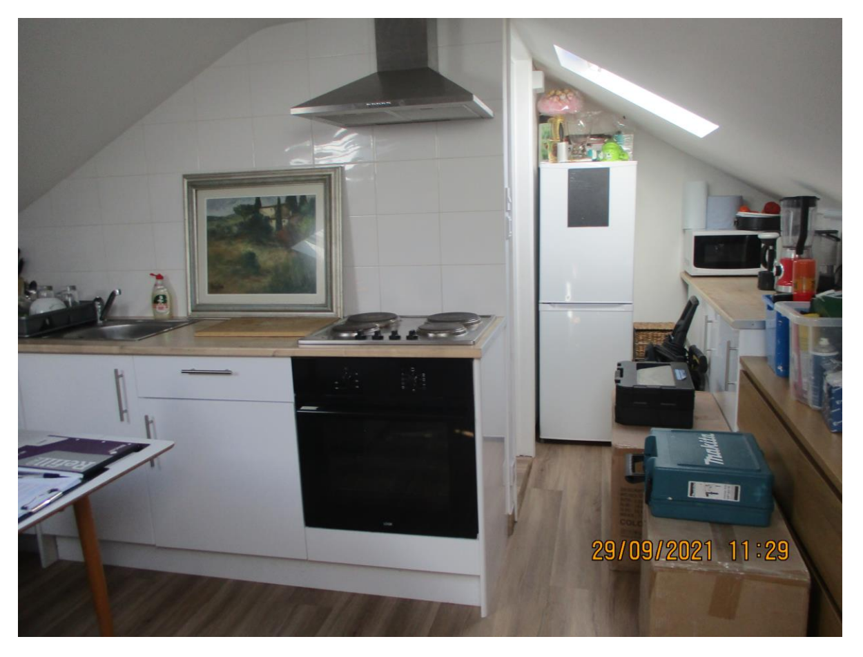
Figure 1studio kitchen

Assistant Director for Sustainable communities Date: 9 March 2022