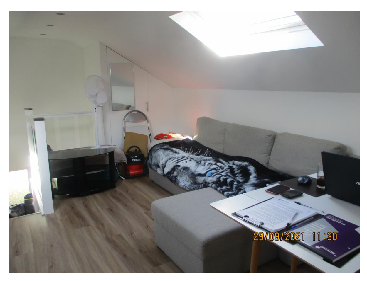
Figure 3 studio sofa bed